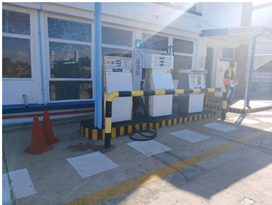
Figure 1: Under Ground Engen Diesel tank

The existing Engen installations have a valid Consumer License approved by the Ministry of Mines and Energy. The site operations and installation are in accordance with Engen Namibia (Pty) Ltd policies and regulations. The diesel is stored in a 4500L underground tank see Figure 1 below.