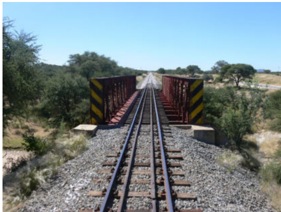
Photo 3.1.4 - Epako River Bridge