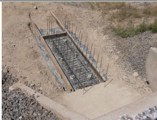
Photo 3.8.3 – Culverts are being reconstructed between Okozongoro and Etuo Siding