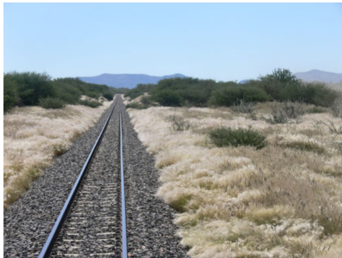
Photo 3.4.2 – Acacia shrubs become woody and dense north of Omaruru