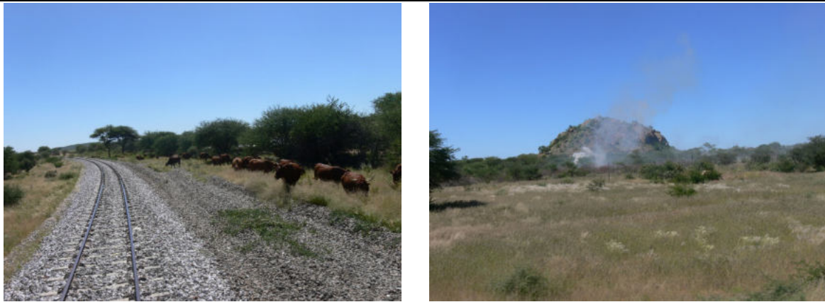
Photo 3.5.2 – Cattle farming and coal production is the predominant farming activity

The land owners of the commercial farms were identified and contacted during the Public Participation Process.