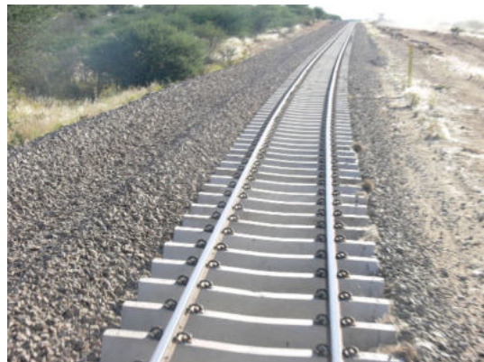
Skeleton tracks without ballast may not be longer than 4 km during maintenance for Health and Safety reasons