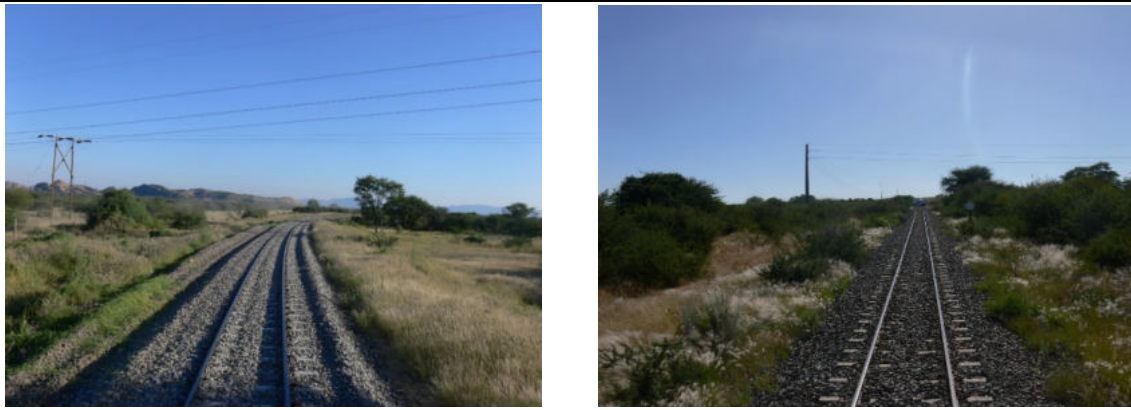
Photo 3.7.4 – Powerline crossing north of Norman Siding and south of Parasis Siding