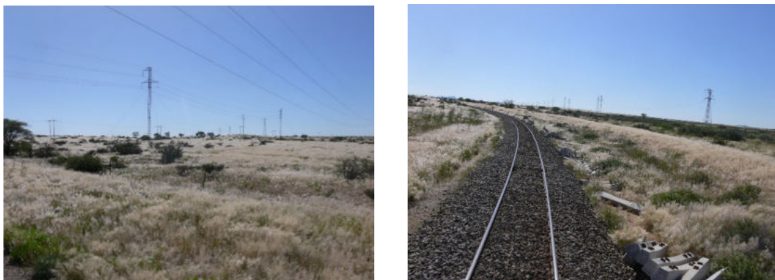
Photo 3.7.3 – Powerlines cross the railway line near Kranzberg and runs // east of the line in Section 1

NamPower powerline runs parallel to the railway line between Karibib and Otjiwarongo and can be seen from the railway line for most of the way. Powerlines also cross the railway line at several points. Powerline crossings were noted.