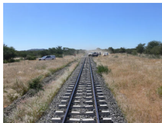
Photo 3.7.1 – A Service Road runs east and west of the railway line