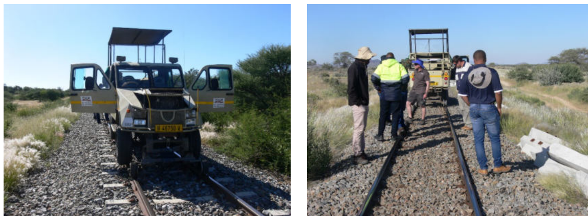
Photo 2.1.1 – Rail trolley used during field survey and Project Team accompanying Specialists

A two-day field visit was conducted during April 2022 after the rain season along the railway line from Kranzberg Station to Omaruru Station and from there to Otjiwarongo Station (referred to as Section 1 and 2 of Phase 1).