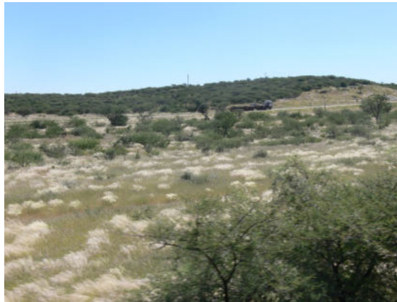
Photo .3.7.2 - C 33 runs parallel to the west of the railroad between Omaruur and Otjiwarongo

The C33 Main Road runs parallel to the western side of the railway line from Omaruru to Otjiwarongo in Section 2. The C33 connects Karibib, Omaruru, Kalkfeld and Otjiwarongo.