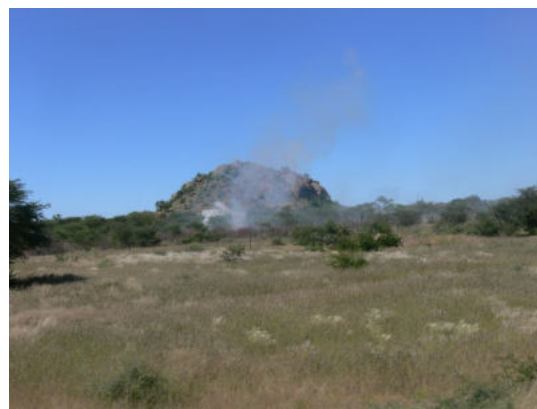
Photo 3.2.2 – Charcoal burning cause some form of air pollution on a small scale

Around Omaruru and Otjiwarongo towns the railway line passes through industrial area, but no manufacturing or air emissions are present here. Refer to Photo 3.4.6 in Section 3.4.2.2.