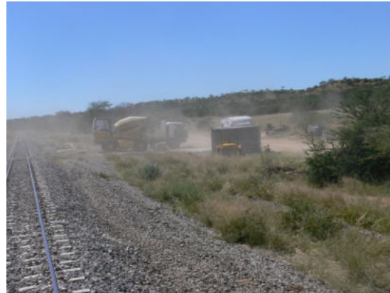
Photo 3.2.1 – Maintenance vehicles on the service road cause dust emissions