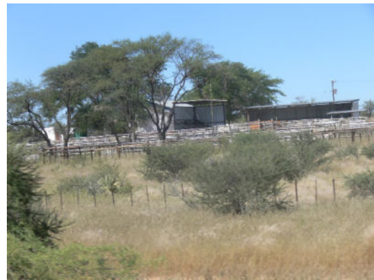
Photo 3.5.6 - Industrial area south of Omaruru