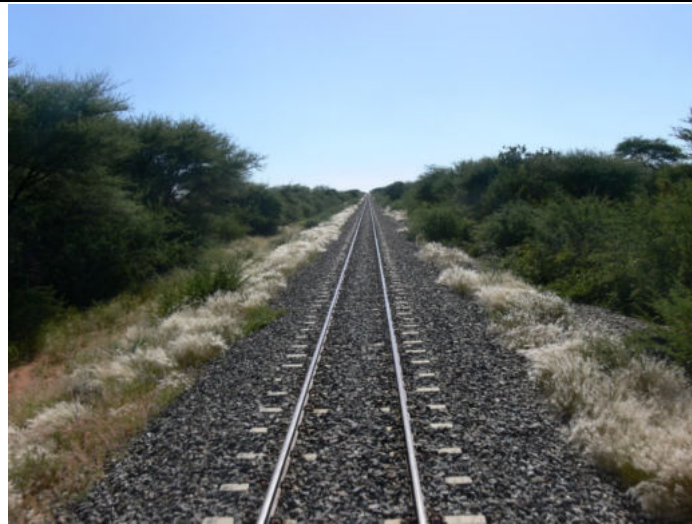
Photo 3.4.3 – Taller Acacia trees and shrubs near Otjiwarongo Station

Vegetation along cross-cutting ephemeral rivers and drainage lines, mentioned in Section 3.1.3, are mostly riverine trees.