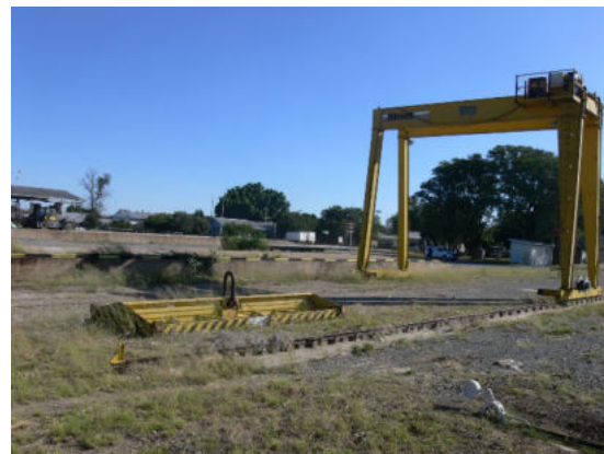
Photo 3.7.6 – Omaruru Station with storage facility and Otjiwarongo Station with crane