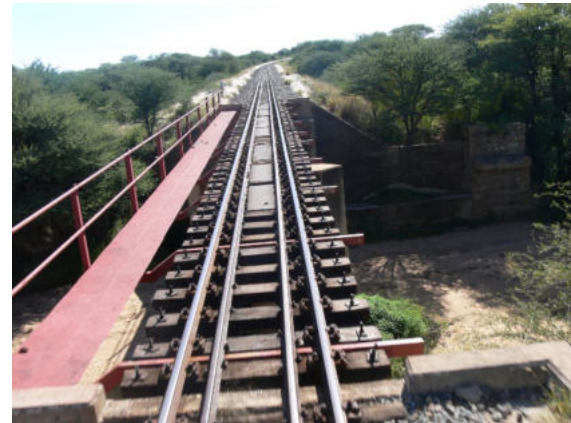
Erundu River Bridge