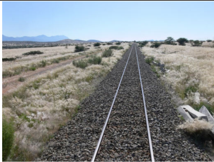
Photo 3.4.1 – Grassland with dispersed small to medium shrubs north of Kranzberg Station