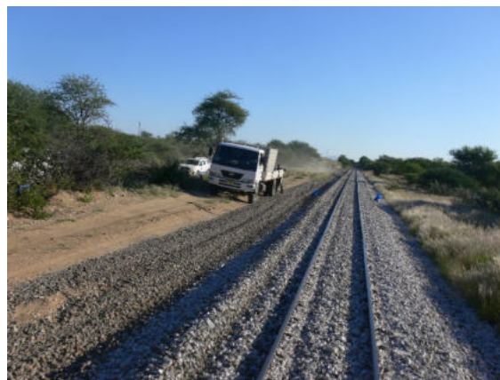
Photo 3.8.4 – Maintenance staff are being transported to site by bus and trucks are used to transport maintenance material.

Occupational Health and Safety as well as Public Health and Safety is identified as an Environmental Aspect that will be investigated during the EIA.