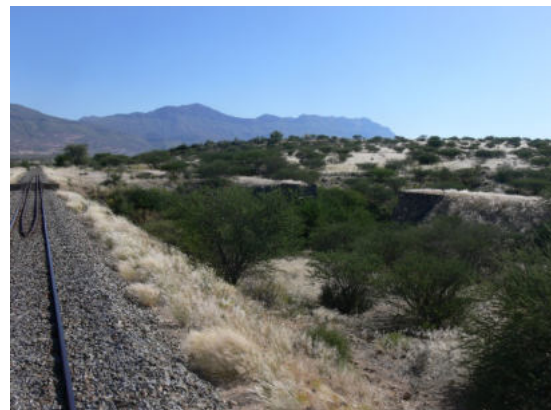
Photo 3.6.1 – Old embankment east of current railway line Section 1 Sample 1