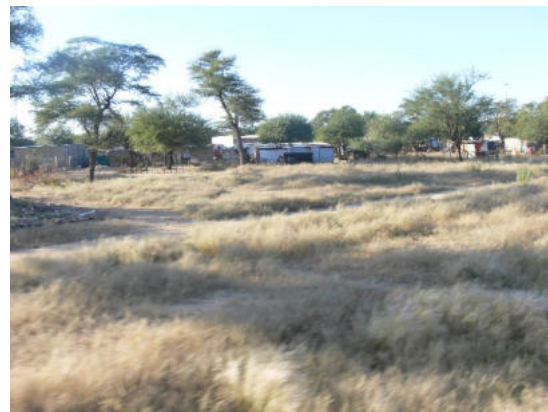
Photo 3.5.4 – Electrified game fence of an estate and an informal settlement south of Omaruru

The railway line will pass through Kalkfeld settlement. Here is a station that was operational in earlier years and the settlement can be used for constructions camps, laydown areas and/or to source construction labour. The settlement can also be reached via the C33 Main Road.