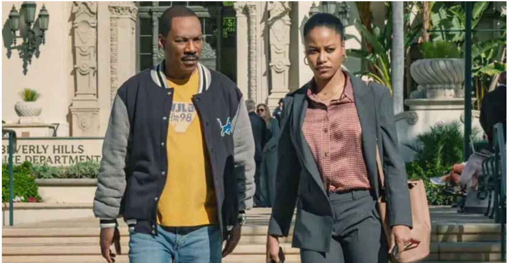
The LA Times said it was “clear that Murphy possesses an affection for the title character”

“And while it’s a very modern release – via streaming rather than movie theatres – everything else leans pretty