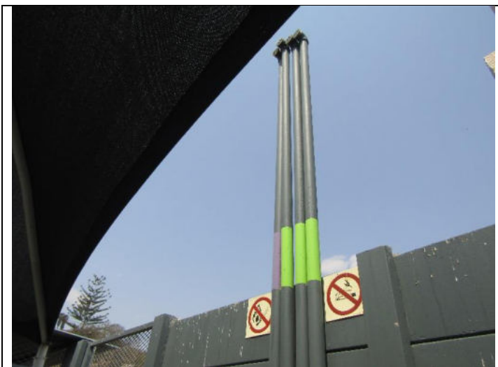
Image 1: Vent pipes have been installed on site (3m) to release vapors above the immediate atmosphere to enhance pollution attenuation.

See photos in figure 3 below of hydrocarbon vapours and odours pollution control measures currently on site