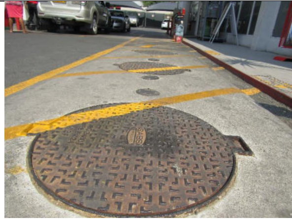
Image 2: Oil and water separator pits emptied regularly by certified contractors.