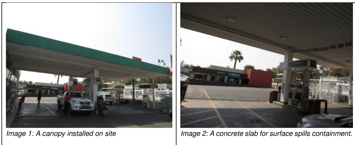
Figure 1: surface pollution control measures currently on site

See photos in figure 1 below of surface pollution control measures currently on site.