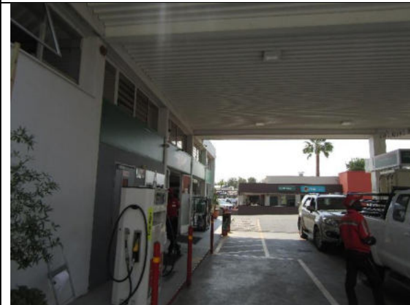
Image 3: Personal protective clothing (head cover, safety boots, overall)