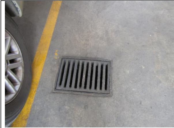
Image 1: Oil and water interceptor at filler points to collect wastewater and oils from the forecourt to the water and oil separator pits

See photos in figure 2 below of underground pollution control measures currently on site