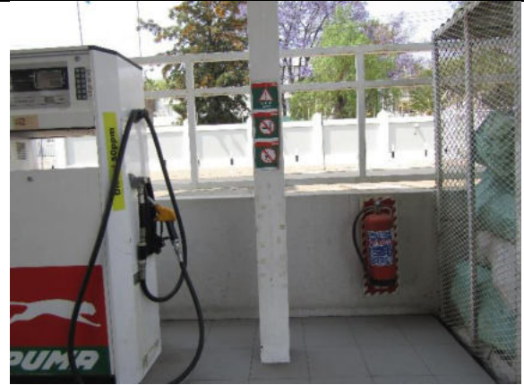
Image 2: safety signs forbidding smoking, switching off running engines and no cell phone usage during filling up.