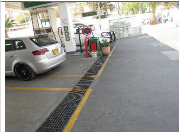
Image 3: Storm water drainage around the site, connected to municipal storm water reticulation