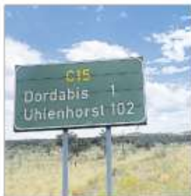
Inwoners van Dordabis wil hê die regering moet ingryp.

Die nedersetting, wat die tuiste van sowat 1 000 mense is, val onder die Windhoek andelise-kiesafdeling.