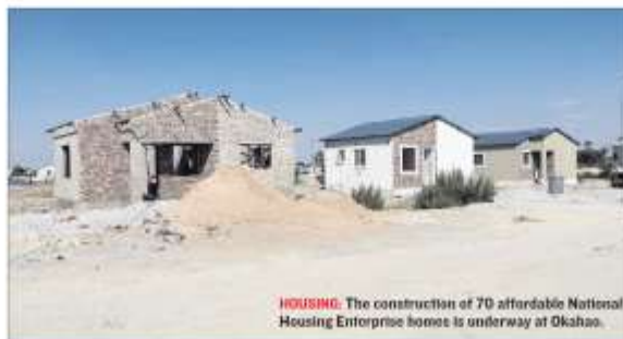
HOUSING: The construction of 70 affordable National Housing Enterprise homes is underway at Okahao.

"We are all serious about this country," one of the community members, who preferred to remain anonymous, said.