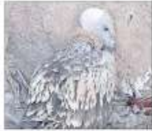
Die Kaapse aasvoëlkuiken met die naam Phoenix.