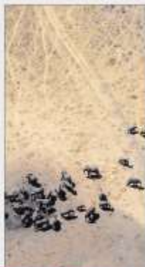
CONSERVATION INITIATIVE: A report on the first-ever synchronised and coordinated aerial survey of Africa's largest savannah elephant populations will be made public by May/June.