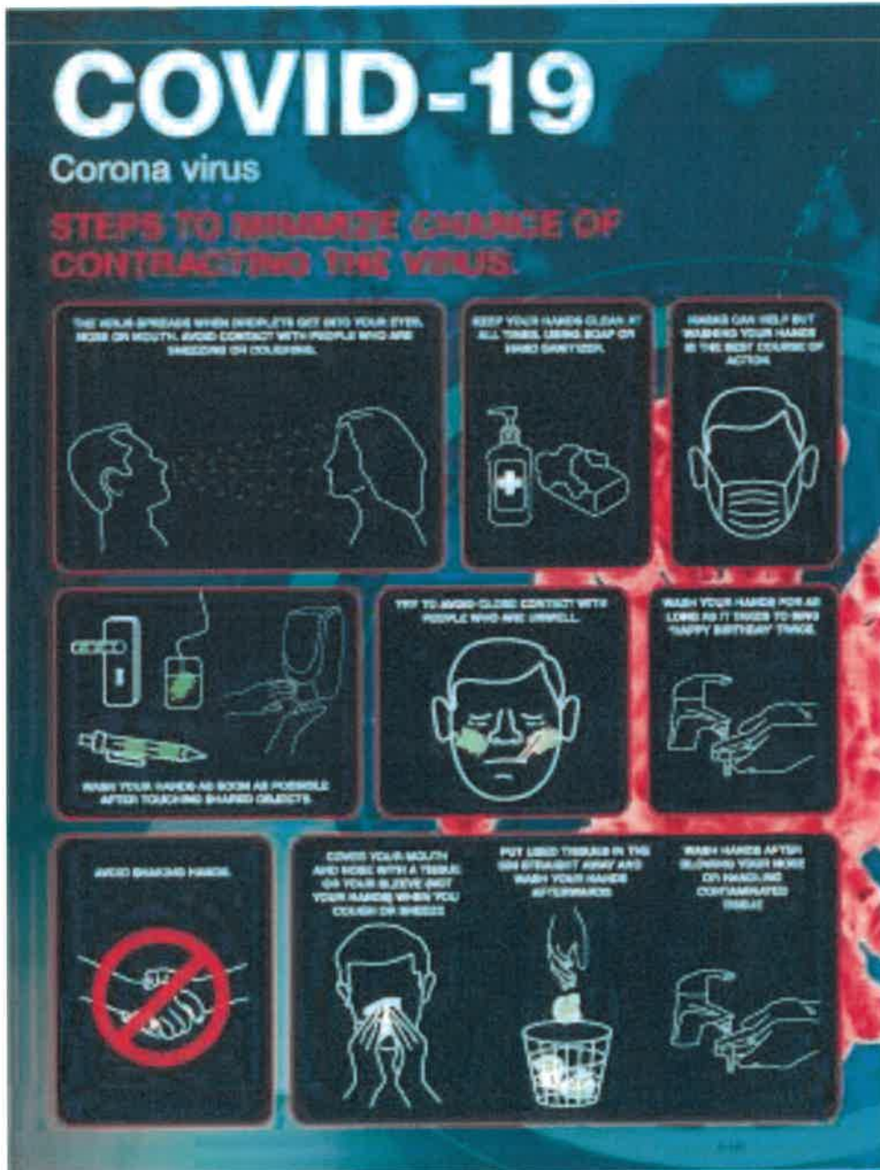
Figure 1: Typical COVID-19 information poster to be placed at designated areas at the mining sites.