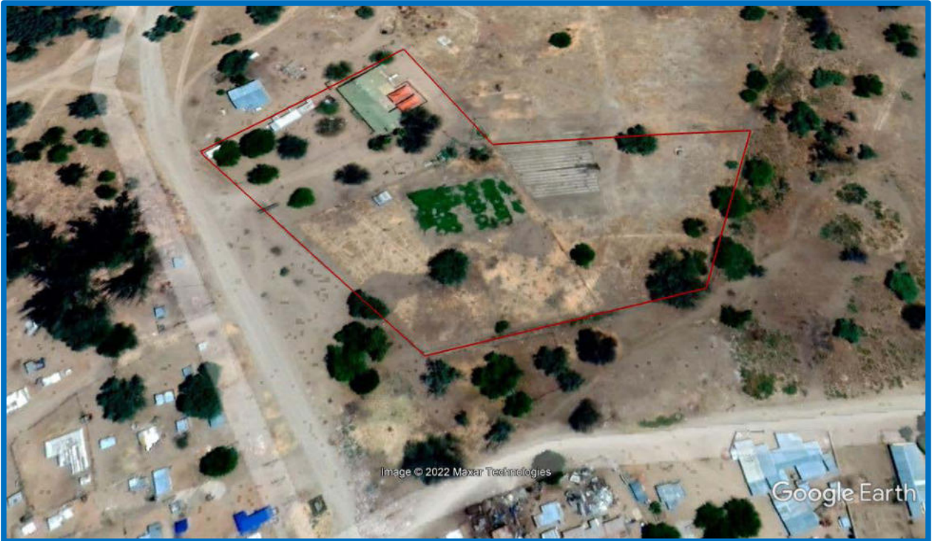
Figure 1: Aerial View of The Remainder of the Consolidated Portion F Okahandja Town & Townlands No.57