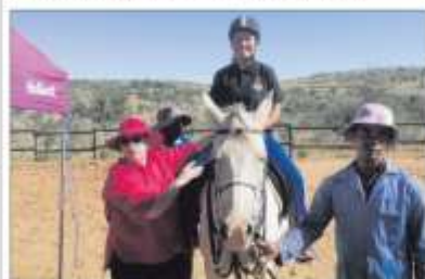
Leerlinge kan by Dagbreek groot voordeel trek uit die perde en leer geweldig baie oor hoe om die diere te versorg.