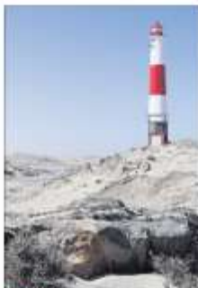
JOINT: Namibia and Germany committed to speeding up the implementation of the joint development projects.

This was announced in a joint statement issued by the National