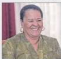
First Lady Surtjie Mumba.