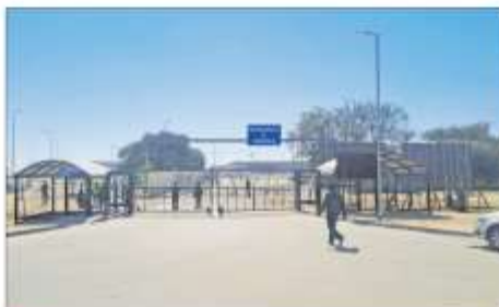
BOOST: The Oshikango-Santa Clara border is now open 24 hours a day.

"After the economic devastation that was mainly caused by Covid-19 pandemic, it is important to adopt various measures aimed at reviving our economy," Kawana said. "The 24-hour operation at Oshikango-Santa Clara border post is but one such measure which is aimed at reviving our economy. I also believe that additional measures such as the introduction of [the requirement of] national identity documents in place of passports between