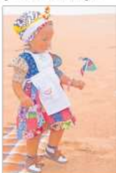
Hierdie is 'n foto wat as deel van Republiekain se lesersfotokompetisie ontvang is.

Ter viering van die Internasionale Dag van die Afrika-kind, het president Nangolo Mbumba 'n verklaring uitgereik waarin hy daarop gewys het dat alle uitdagings steeds Namibië in die gesig staar. "Die dag is vanjaar onder die tema "Onderwys vir alle kinders in Afrika: Die tyd is nou" gewier. "Alle Afrikalande, insluitend Namibië, staan steeds voor groot uitdagings in die onderwyssektor. "Dit sluit in ekonomiese strukturele blokke, die gebrek aan infrastruktuur, geslagsongelykheid en kulturele praktieke is veelvlakkig en vereis dus 'n multibelanghebbende benadering om blywende oplossings te vind," het hy gesê. Hy meen dat Namibië belangrik in hierdie sektor moet prioriteiseer en beleide moet implementeer wat doelgerigte ondersteuning aan gemarginaliseerde groepe, soos kinders met gestremde hede, bied. "Hy het ook daarop gewys dat die implementering van gratis primêre en sekondêre onderwys 'n groot mylpaal vir die land was. "Ons verbintenisse tot onderwys word weerspieël in begrotingsvoorwysings, met die onderwyssektor wat die groot-