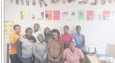
'n Groep leerlinge is besig om te leer hoe om kliente se hare te doen en die dogters geniet die klas tereel.