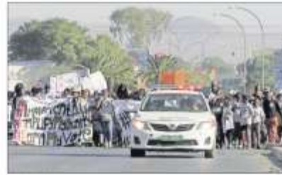
FOTO FACEBOOK 'n Klagskrif is aan die minister in die presidensie verantwoordelik vir geslagsgelykheid, armoede-uitwysing en maatskaplike welsyn, Doreen Sioka, oorhandig. Die veldtog is deur die Basic Income Grant (BIG) Coalition of Namibia van stapel gestuur en

Luidens die klagskrif eis die groep dat die regering sy verpligtinge ingevolge die Namibiese Grondwet nakom. 'n Groot skare mense, veral jongmense, het Saterdag aan 'n optog deelgeneem ter ondersteuning van 'n basiese inkomstetoelaag (BIG) van N$500 per persoon per maand. Die betog het omstreeks 08:00 vanaf die Katutura-jeugkompleks begin en het ten doel gehad om die aandag te vestig op die dringende behoefte aan regeeringsoptrede in die implementering van 'n basiese inkomstetoelaag.