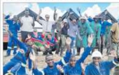
By Dagbreek is 'n groep leerlinge geresd om bakstene te maak.