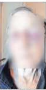
Die 71-jarige vrou is glo gewurg, geslaan en gebyt.