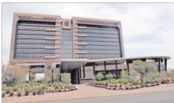
NOT TRUE: The immigration ministry has urged the public to refrain from 'spreading misinformation that undermines its integrity'.