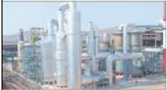
Die Tsumeb-smelter is een van die min aanlegte wat komplekse kopererts kan smelt.