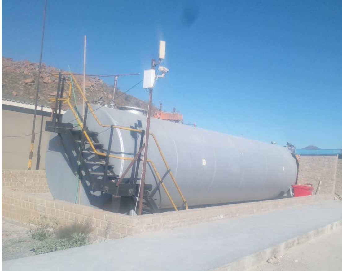
Figure 1: Above Ground Engen Diesel tank