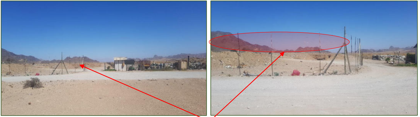
Figure 7: The extension of the fence