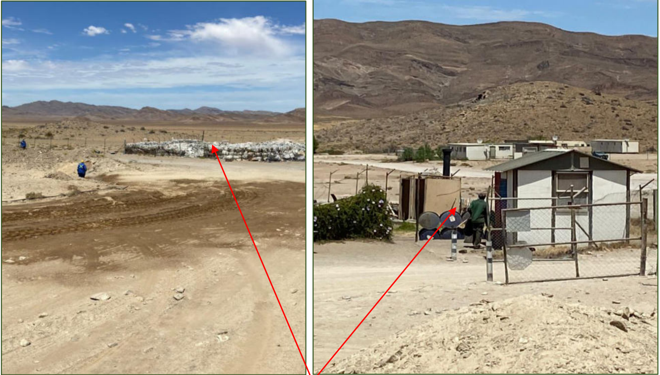
Figure 5: Recycling facility on site and Guard House