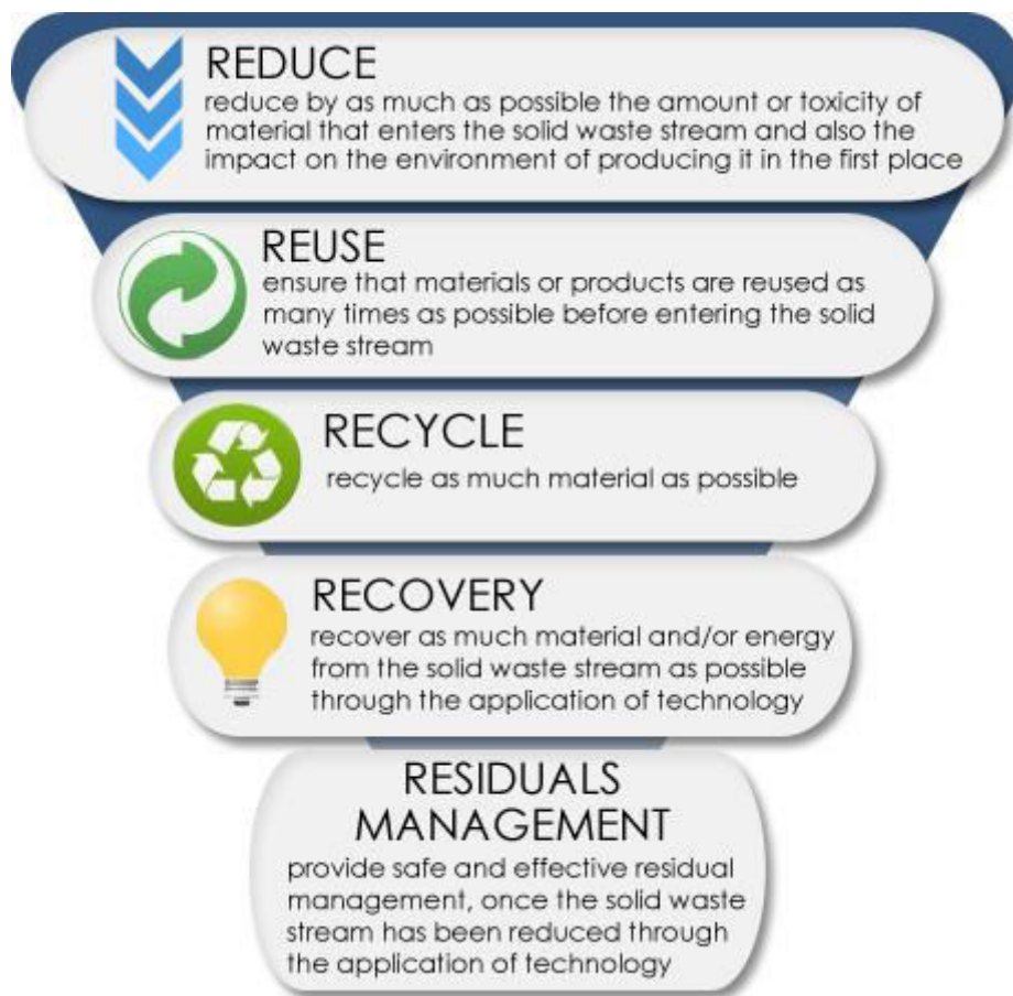
Figure 9: 5 R Pollution Prevention Hierarchy