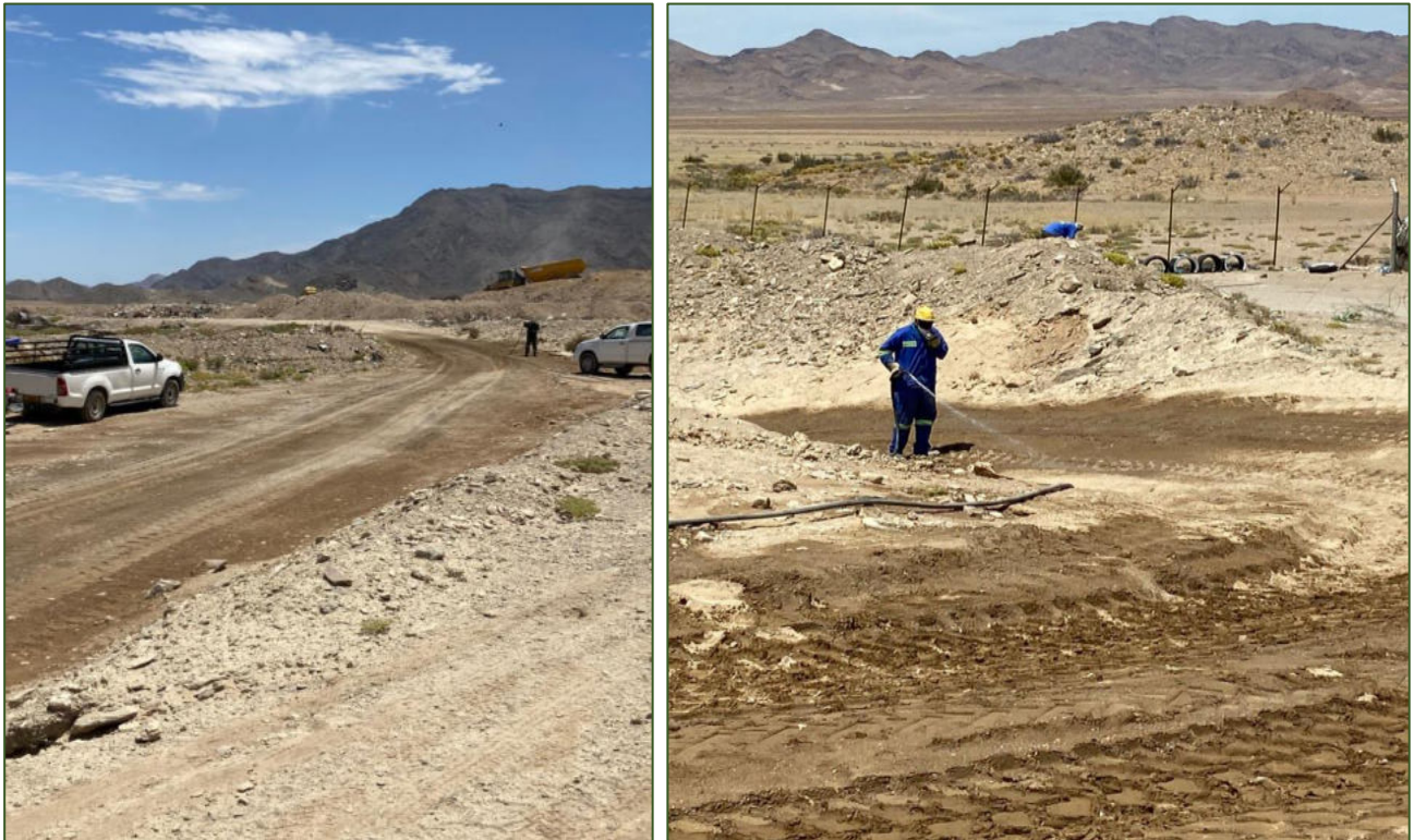
Figure 6: Dust suppression on the internal roads – on site operations