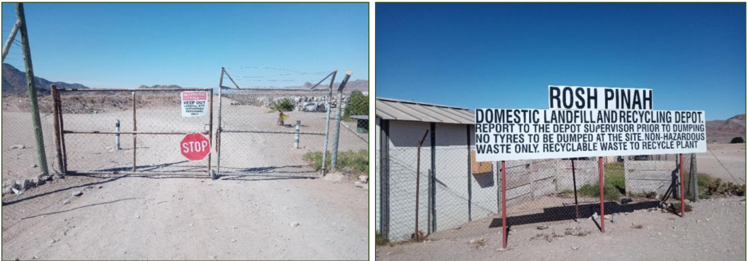
Figure 8: Entrance gate to the Landfill Site