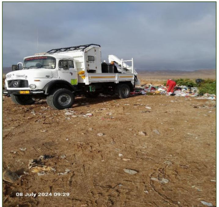
Figure 4: Waste Transfer by Waste Contractors – Cell 3