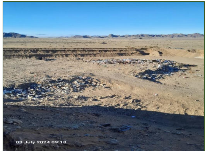
Figure 3: Cell 3 completed excavation and dumping area