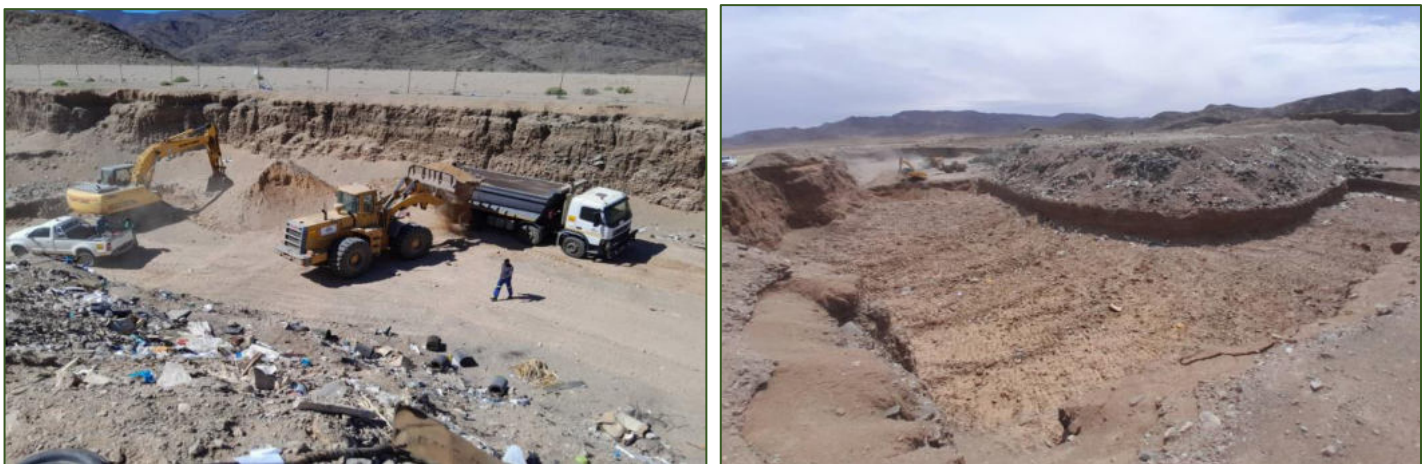
Figure 2: Cell 3 Commencement of Excavation in process & Waste compaction and covered cell 2 in the foreground.

Following the conditions of the previous ECC and the approved EMP, bi-annual environmental reports pertaining to the operations of the landfill were prepared during the validity period of the ECC. The reports were submitted to Ministry of Environment, Forestry & Tourism: Department of Environmental Affairs (MEFT:DEA). The proof of submission (report cover pages are attached to this EMP under Annexure H .