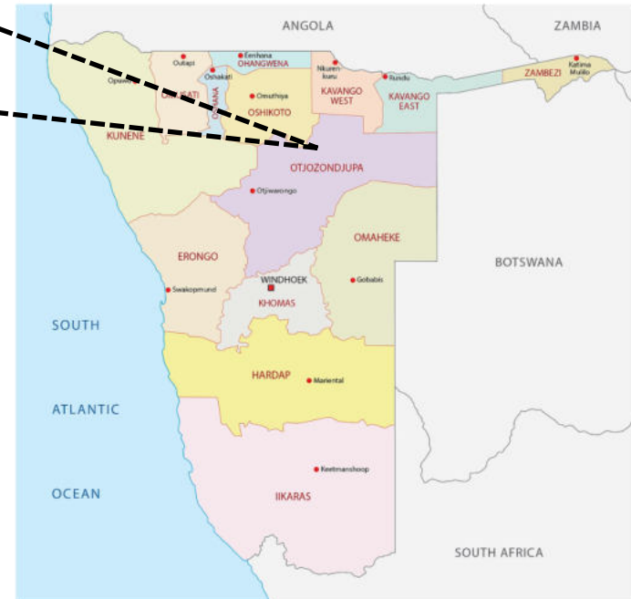
Namibian Regional Map