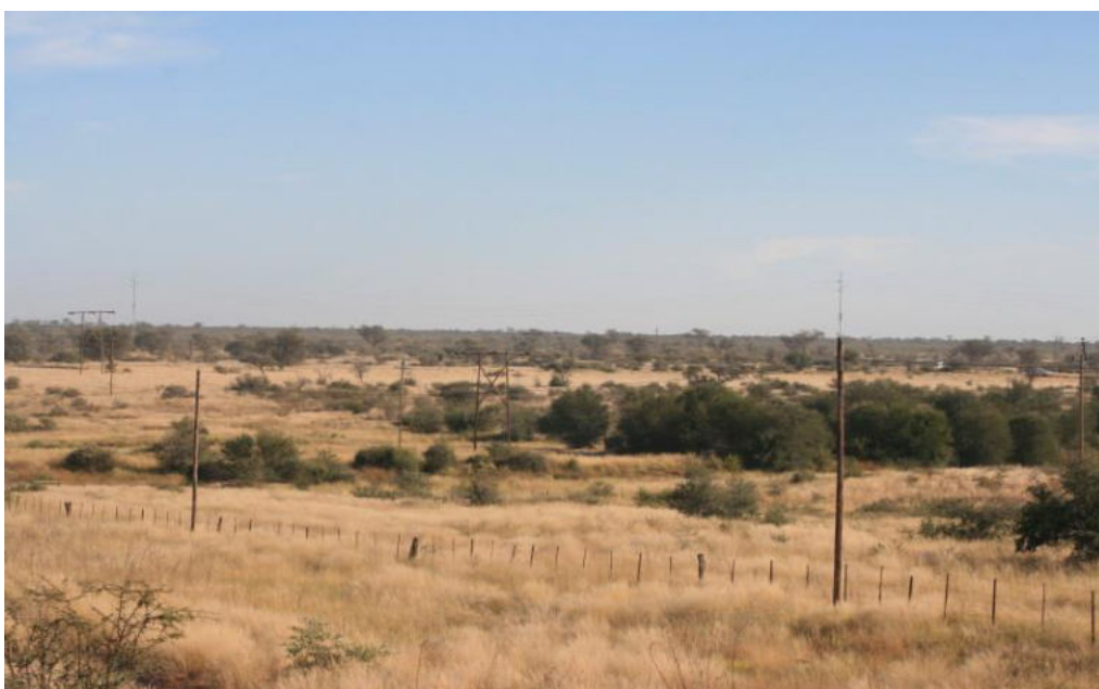
Figure 3. The ephemeral Black Nossob River is viewed as a sensitive (“high”) area.