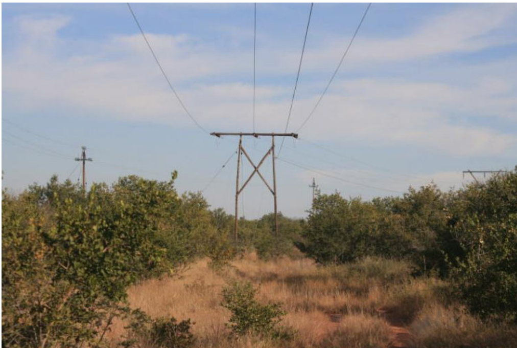
Figure 2. The well vegetated hill north of Gobabis is viewed as a sensitive (“high”) area.

The route passes through 5 “hotspot” areas with all 5 areas classified as “high” sensitivity. The areas of “high” sensitivity are viewed as the hill north of Gobabis; Black Nossob River; borrow pits with water; hill and omuramba east of Witvlei (i.e. areas with high biodiversity) (Cunningham, 2020). This powerline is 50.4km in length of which 5.3% are viewed as “high” sensitivity with the rest of the route (94.7%) viewed as “low” sensitivity. Below are figures showing some of the hotspot areas.