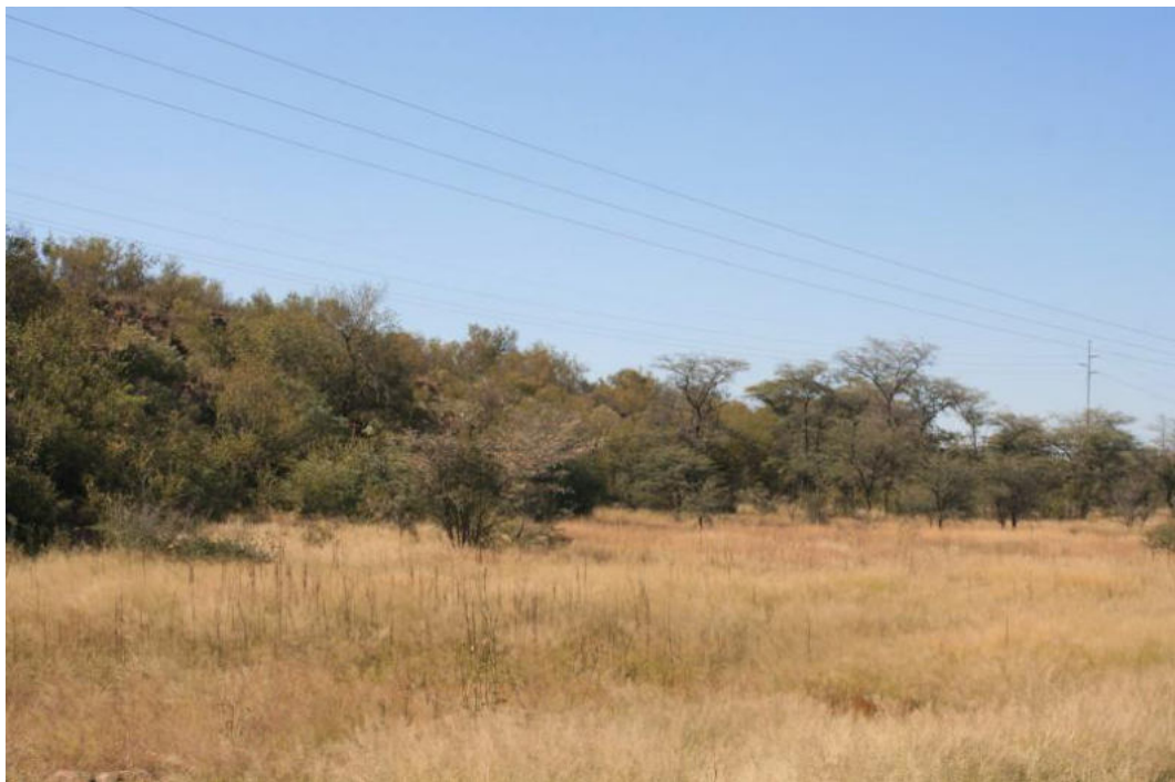
Figure 5. Well vegetated hill and omuramba area east of Witvlei is viewed as sensitive (“high”) habitat.

The “high” sensitivity areas especially in and adjacent water features (Black Nossob River, borrow pits with standing water, well vegetated hills) should be avoided when applying herbicides and should rather be cleared using the tradition manual hand clearing techniques.