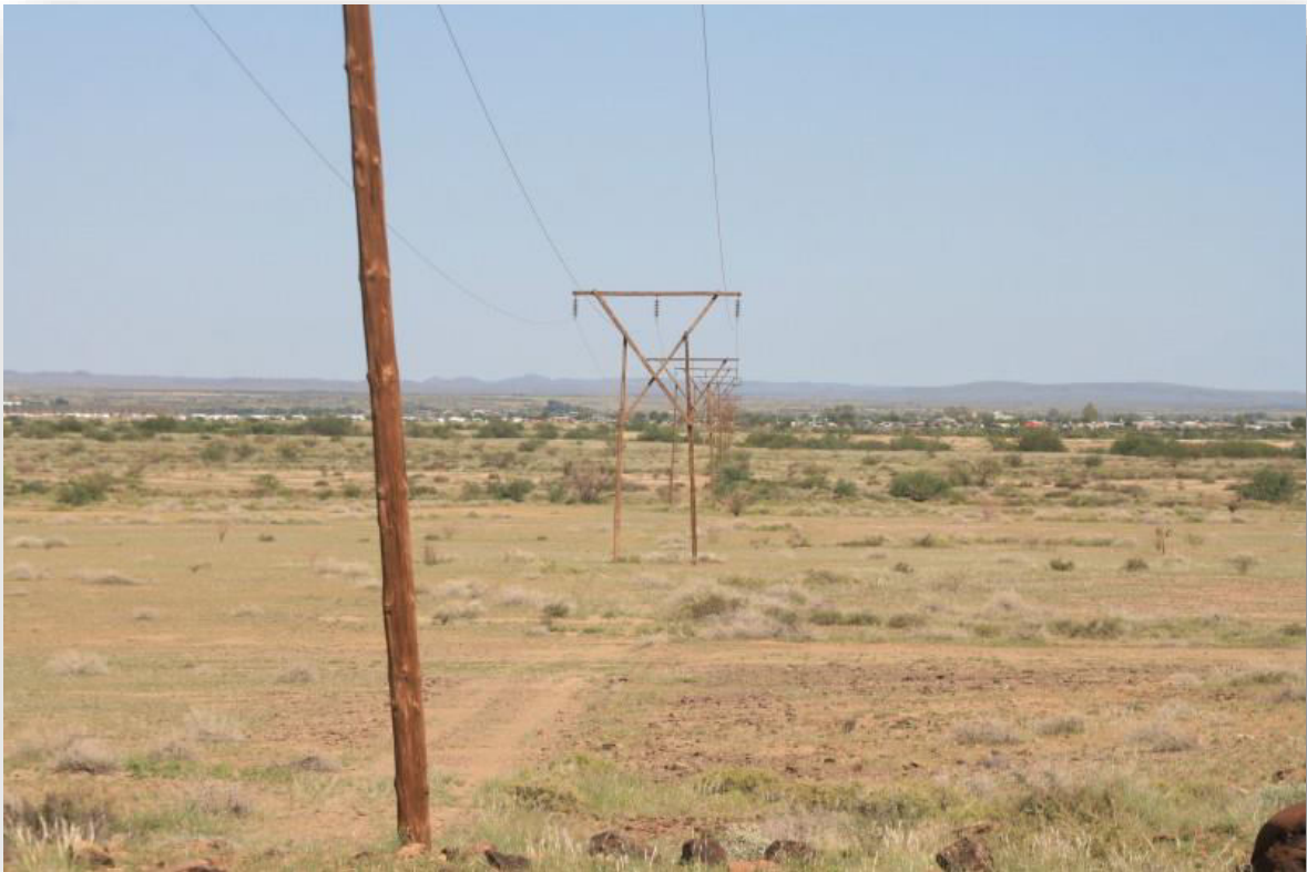
Figure 2. The 66kV Mariental-Hardap line with Wood Kamerad structures passing through flat undulating terrain with small ephemeral drainage lines, dominated by shrubs and Stipagrostis spp. grasses.

The 66kV Mariental-Hardap route runs for approximately 2km through a Township on the southern boundary of Mariental i.e. urban area and heavily impacted by anthropogenic activities. Once outside the Township area, it is open and sparsely vegetated. Along small drainage lines, there are very dense patches of the invasive alien Prosopis spp. This line transverse through town lands; escarpment and farms with mainly gravel plains and undulating terrain (Cunningham, 2021).