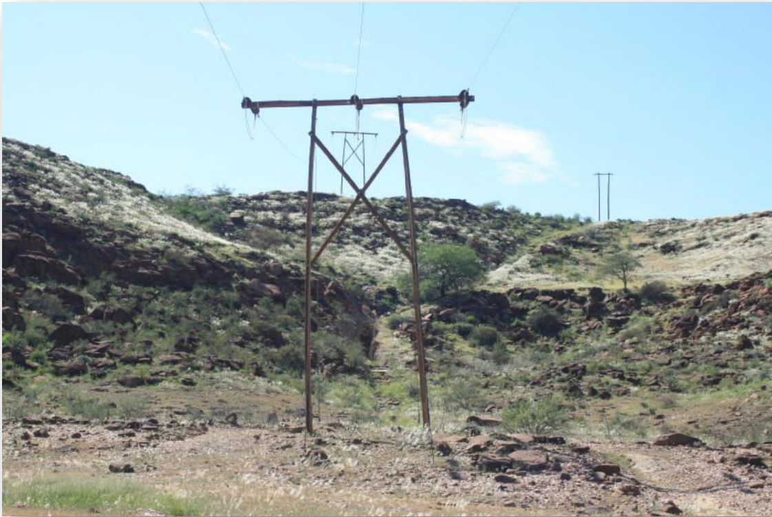
Figure 4. The escarpment area east of Mariental is viewed as sensitive habitat (“medium”).

The impact of common line and substation activities such as inspections and general maintenance activities would be site specific and have a relatively small environmental “footprint” and is not expected to have a major impact on the environment. In addition the effects of the debushing activities to clear the access route for the line will have environmental effects that are within the NamPower servitude.