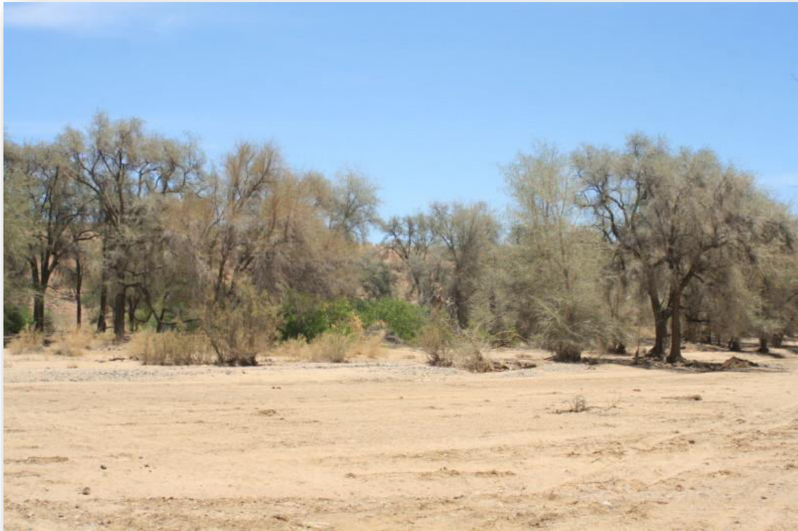
Figure 3. A large ephemeral drainage line like the Khan River is viewed as a sensitive habitat (“high”).