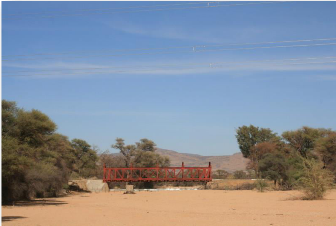
Figure 2. Ephemeral drainage line with dense riparian vegetation and larger trees is viewed as an important habitat i.e. “high” sensitive area.