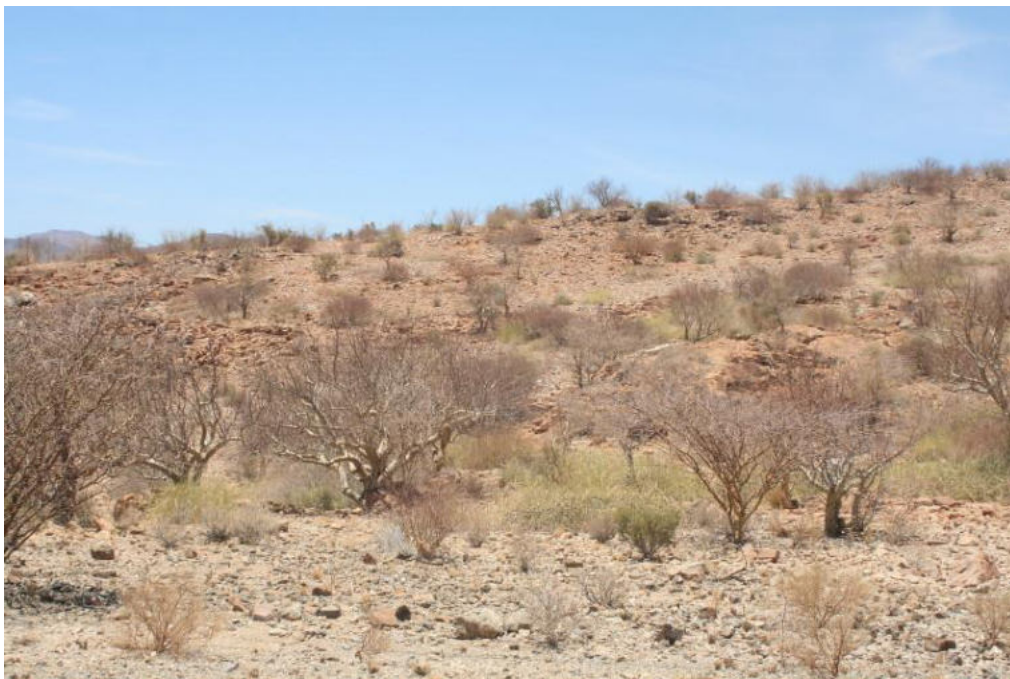
Figure 4. Mountainous terrain with a variety of Commiphora species, including the endemic and protected C. virgata (slender corkwood), is viewed as a sensitive habitat (“high”).