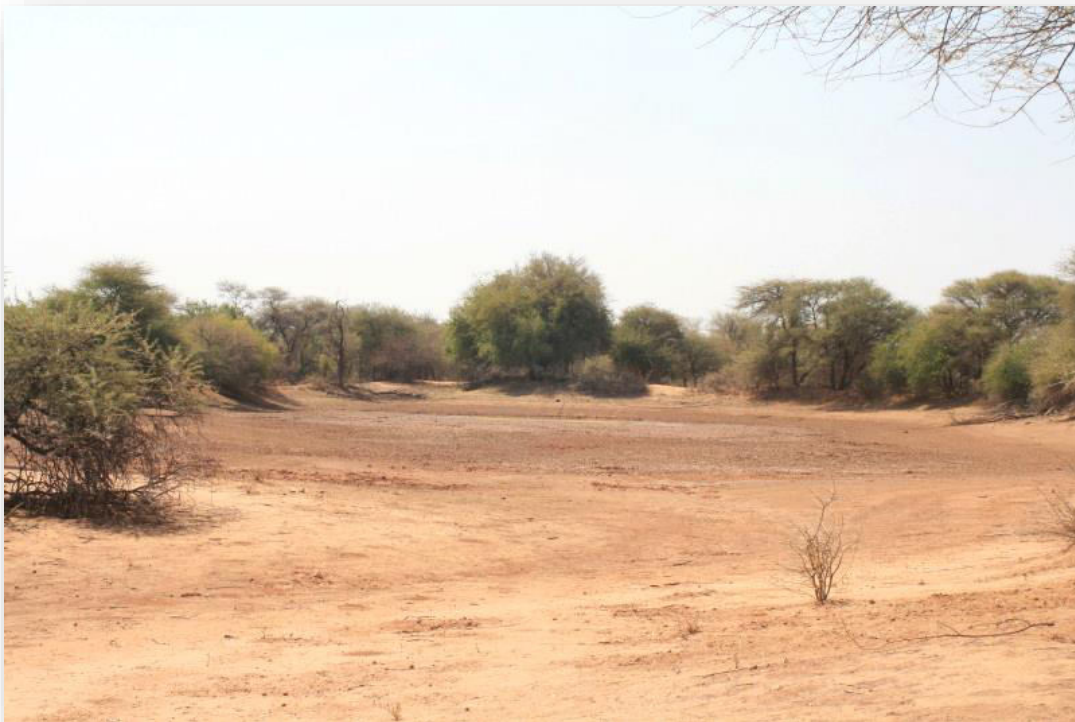
Figure 4. A ground dam, albeit artificial, is nevertheless viewed as a sensitive habitat (“high”).