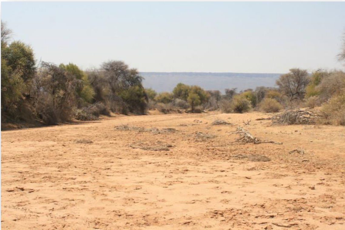
Figure 2. One of the larger ephemeral rivers encountered along the route viewed as sensitive habitat (“high”)

The route passes through 12 “hotspot” areas with 6 areas each classified as “high” and “medium” sensitivity, respectively. The 6.7% of the total route is viewed as “high and medium” sensitivity while 93.3% viewed as “low” sensitivity with the larger rivers, drainage lines and pan habitats, especially areas with permanent and or seasonal water, being the most important features. The areas of “medium” sensitivity are viewed as farm activity, smaller ephemeral drainage lines and pans while the areas of “high” sensitivity are viewed as the larger well vegetated river/ephemeral drainage lines (especially dense stands of protected tree species); larger pans and farm ground dams (i.e. areas with high biodiversity) (Cunningham, 2019). Below are photos of some of the sensitive areas along this line route.