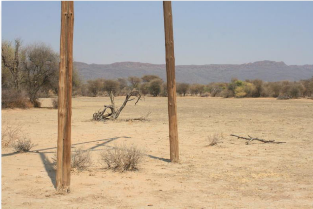
Figure 3. An ephemeral pan in the Waterberg area is viewed as a sensitive habitat (“high”).