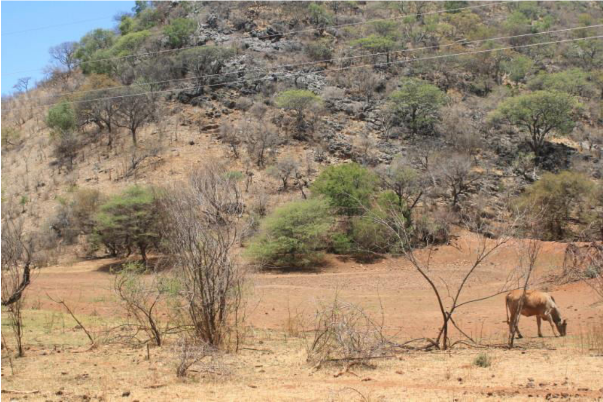
Figure 3. A ground dam, albeit an artificial structure, is viewed as sensitive habitat (“high”).