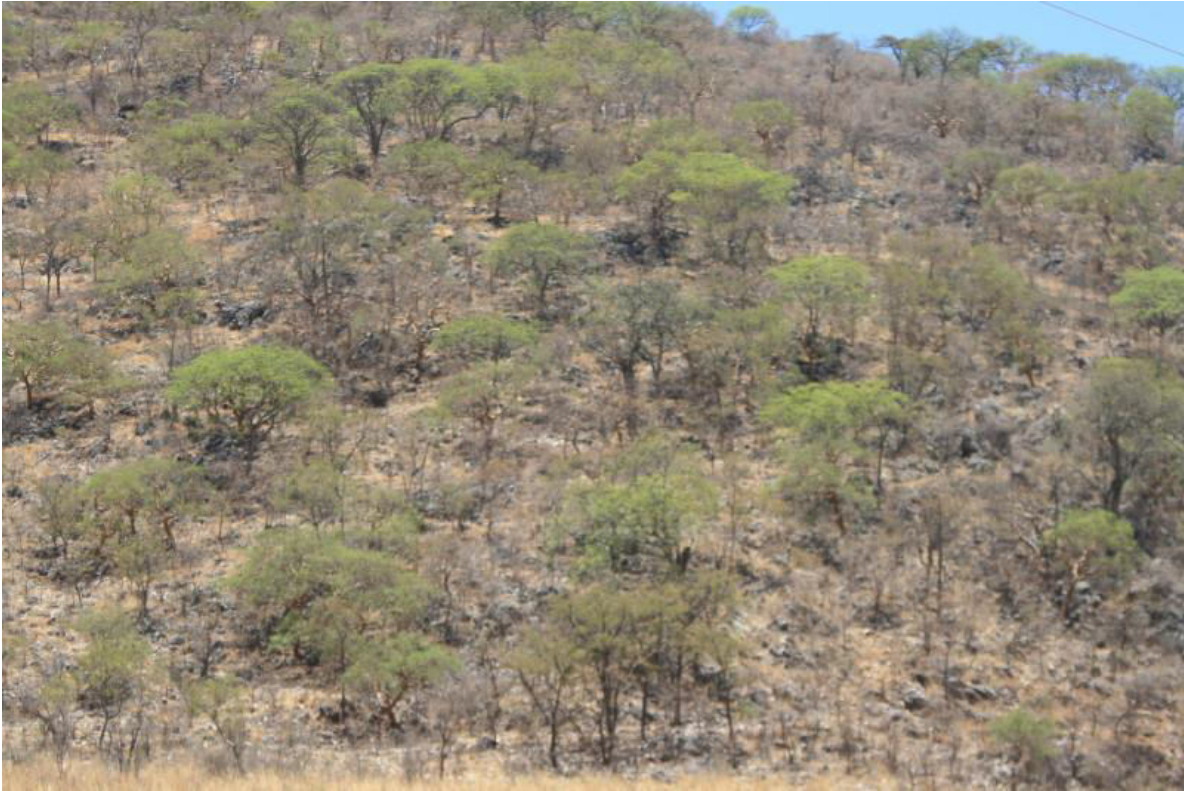
Figure 4. Karst Mountains along the route are viewed as a sensitive habitat (“high”). Unique and protected species are associated with this habitat in Namibia.