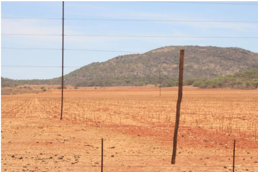
Figure 2. Maize field viewed as sensitive habitat (“medium”).

Nine protected tree species – Vachellia erioloba , Combretum imberbe , Ficus cordata , Erythrina decora , Maerua schinzii , Pachypodium lealii , Sclerocarya birrea , Spirostachys africana Ziziphus mucronata are associated with this line. The main ephemeral rivers draining the general area flow westwards e.g. Omaramba Owambo – or towards the northeast – e.g. Omuramba Omatako (Cunningham, 2019).