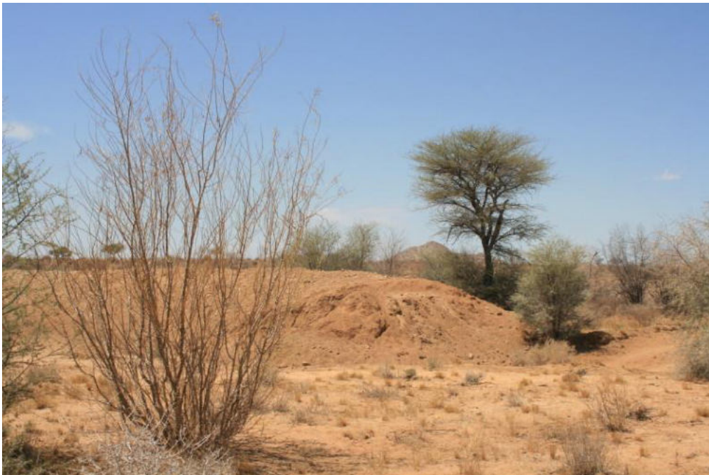
Figure 4. A ground dam along the route is viewed as a sensitive habitat (“high”).