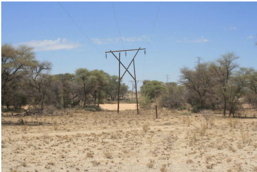
Figure 2. Ephemeral drainage line with dense riparian vegetation and larger trees is viewed as an important habitat i.e. “high” sensitive area.

Five protected tree species: Vachellia erioloba Albizia anthelmintica Boscia albitrunca Faidherbia albida and Ziziphus mucronata are associated with this line. Special permission to remove protected species (for specimens >18cm in diameter) is required as per the Forest Act No. 12 of 2001 (Licence conditions for bush control). The “high” and “medium” sensitivity areas especially in and adjacent water features (large ephemeral drainage lines, ground dam) should be avoided when applying herbicides and should rather be cleared using the tradition manual hand clearing techniques. Figure 2 – 3 below show some of the sensitive areas.