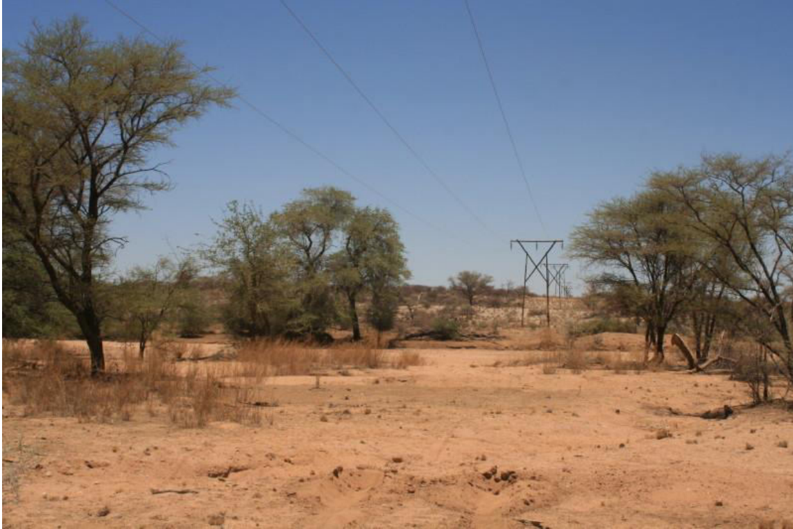
Figure 3. A large ephemeral drainage line like the Khan River is viewed as a sensitive habitat (“high”).