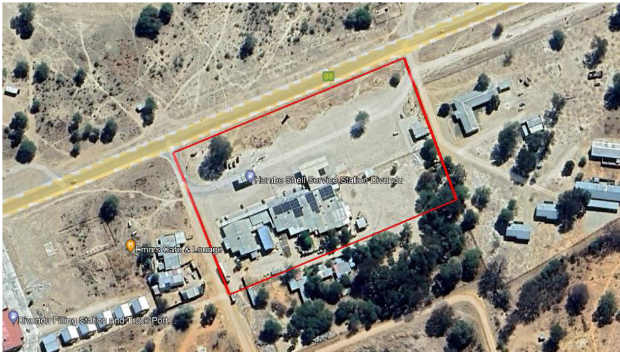
Figure 2. Layout of the site