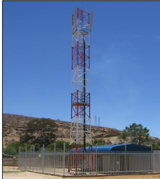
Figure 2-1: Example of the proposed tower ( https://www.powercom.na/index.php/portfolio-details/item/2-lattice#portfolio-wrapper )

It will additionally include the construction of an equipment room which will house the communication equipment. The site will be fenced off in order to limit public access.