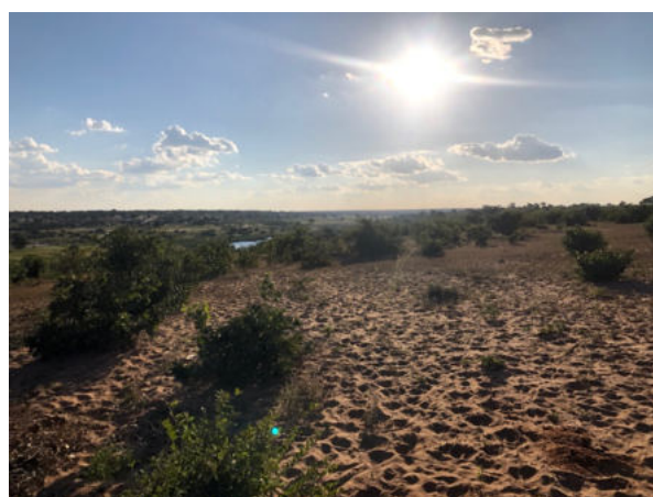
Figure 2: Shrubs on project site