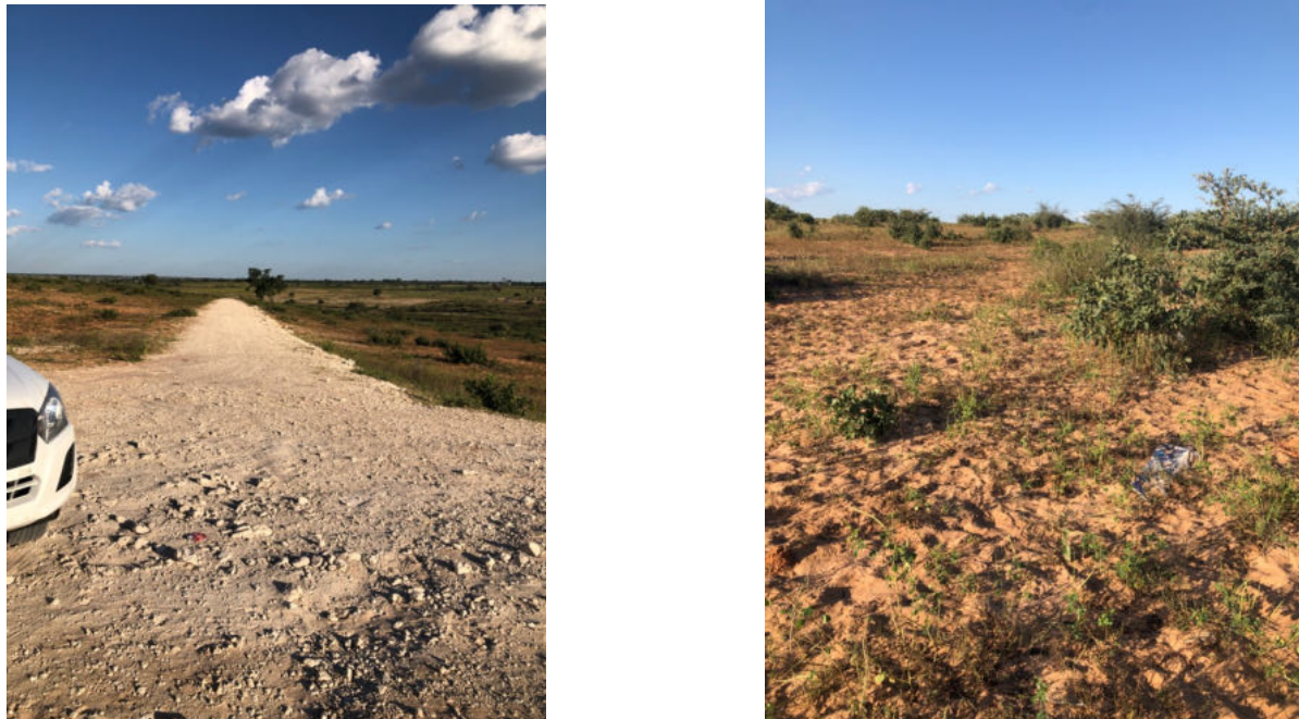
Figure 3: (left) Cleared vegetation, (right) existing road

The site illustrated on figure 7 is largely composed of bare patches of land and shrubs. The area has been affected gravely by urban developments in its vicinity and residents were already using the open area as a waste dumping spot. In addition, nearby residents from informal settlements have been cutting down shrubs for firewood.