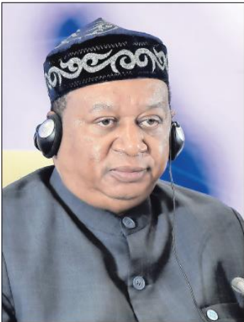
OPEC Secretary General Mohammed Barkindo.