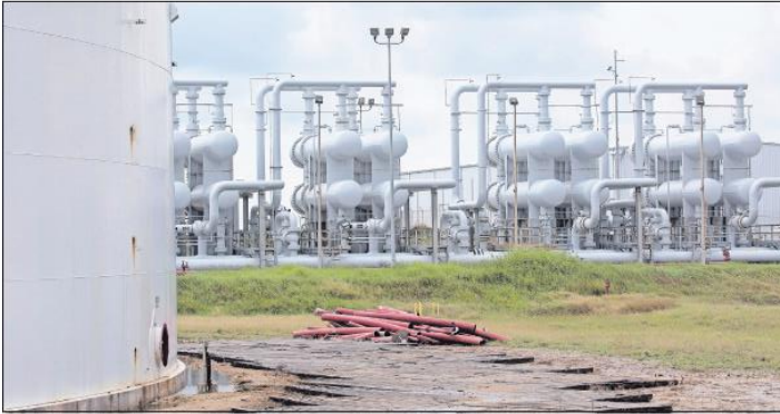
An oil storage tank and crude oil pipeline equipment is seen during a tour by the Department of Energy at the Strategic Petroleum Reserve in Freeport.