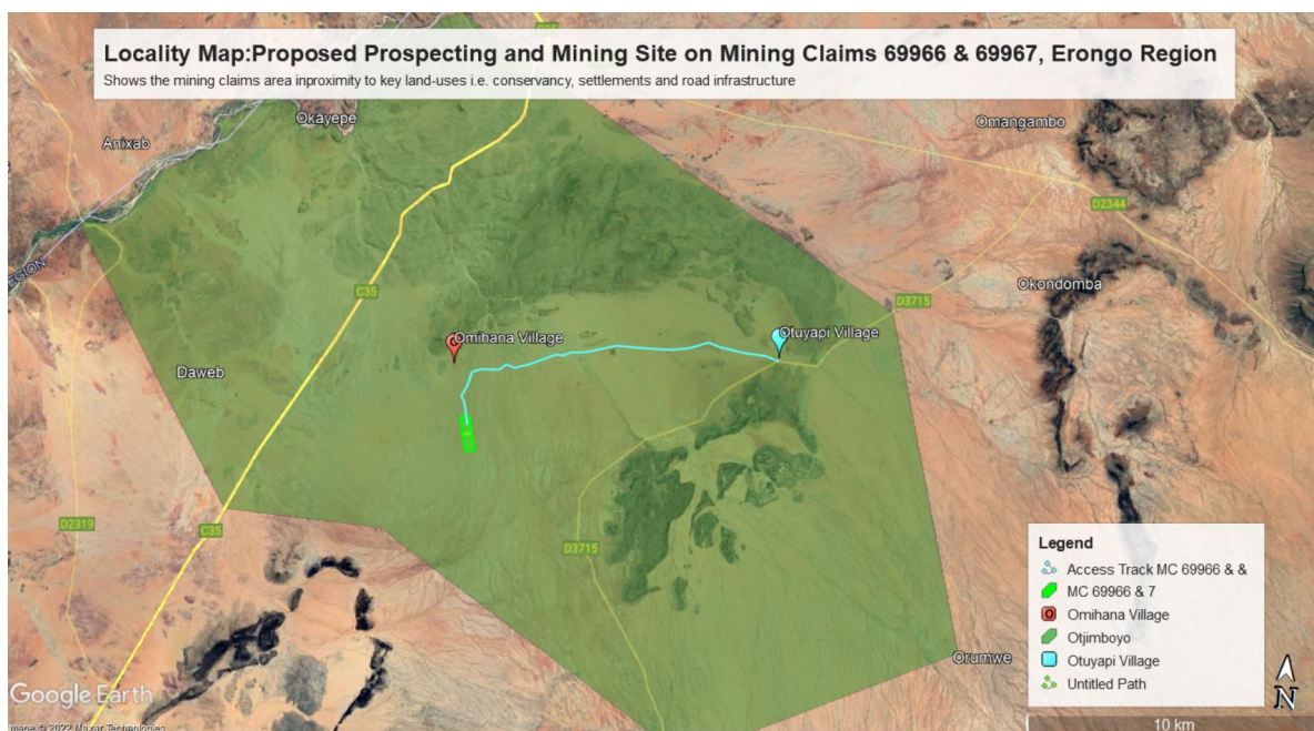
Figure 4 : Locality map of the proposed Mining Claims 69966 & 69967 in the Erongo Region, Namibia.

The proposed claims, although situated with a conservancy, are in proximity (south-west, Figure 5 ) of an old molopo pit with assorted mineralized materials (Ore containing Lithium, Tantalum and Tin) as per the sample analysis results, ((up to 1cm) cassiterite crystals occurrence local concentration of tin in ore ranging from 0, 5-1, 5% was not extracted because of primitive beneficiation recovery methods and rates).