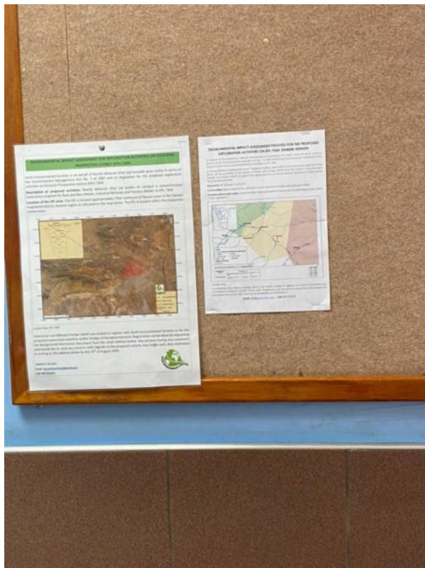
Opuwo Town Council