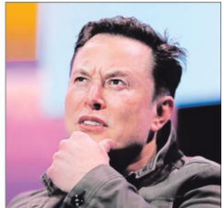
Elon Musk.

Musk has said that he wishes to expand Twitter's user verification system to "authenticate all humans". This might curtail some anonymous abuse on the platform, but will raise fears among vulnerable groups who prefer to keep their identities secret. -Fin24