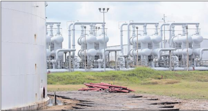
An oil storage tank and crude oil pipeline equipment is seen during a tour by the Department of Energy at the Strategic Petroleum Reserve in Freeport.