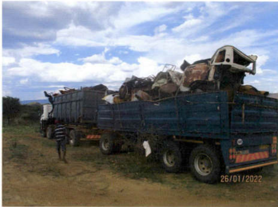
PHOTO 5: The scrap dealer's lorry and trailer fully loaded and ready to leave site for the depot in Windhoek.

It should be mentioned that all work on the Claims had been slowed down by the need for the Company to resume mining operations on its Mining Licences located some 15km from these Mining Claims, in order to comply with the requirements of the Minerals Act. Nonetheless, the backlog is now being caught up. The Company remains committed to attend to the work programme on these Mining Claims and the rehabilitation of the area adjacent to the old mine processing plant site.