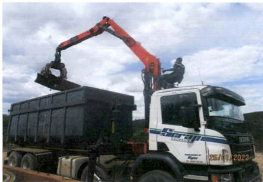
PHOTO 1: Shows the Scrap Salvage crane operator loading scrap metal from the waste scattered around the site. This work is now completed.