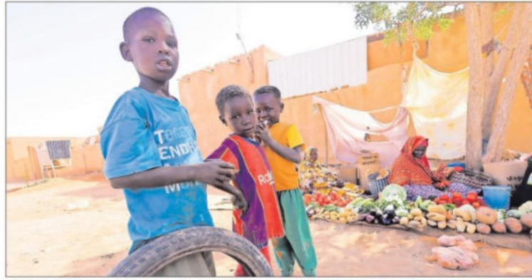
Children wait to buy vegetables in a residential area in Khartoum North, Sudan.