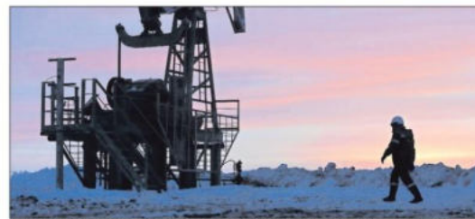
Goldman Sachs cut its price forecasts for this year but boosted the estimate for 2023.

Namib Mills (Pty) Ltd, an equal opportunity employer invites interested and qualified candidates looking for an exiting career in the FMCG industry to apply for the following position: