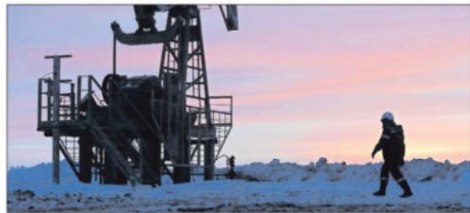
Goldman Sachs cut its price forecasts for this year but boosted the estimate for 2023.