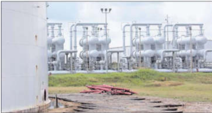
An oil storage tank and crude oil pipeline equipment is seen during a tour by the Department of Energy at the Strategic Petroleum Reserve in Freeport.