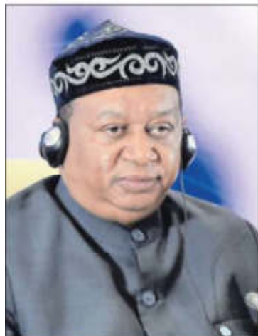
OPEC Secretary General Mohammed Barkindo.