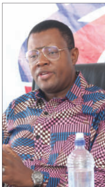
Health is wealth... PDM president McHenry Venaani.

pushed into poverty when having to pay for such services.