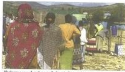
Rhutwena yomabepko papshilalo oyindji moEthiopia itayi mone ekwatho.

Epungelo oya kala noku-pewa usama, kwa talika kutya itali longoshigwanana okukaleka po egameno lyaanona noku kelala iponga kosukola. Oktulungela mo-ongulu dhoosikola dhiitwalil okwa keelelwa moshilongo, ihe epungelo itali tala po sha pshala lyaashika. Niger oku na ompumbwe yikowithelongo ya kolonda, mwa kwatelwa ompumbwe yoongula dhoosikola moshilongo shoka oshi na santu oyindji kaaye shi oko lesha, noshibi wo shinoye shomulilongo mbyoka yi na santu oyendji yili moshibepe. -BBC