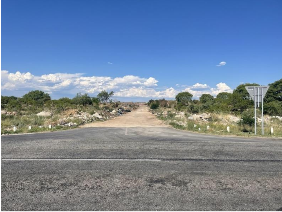
Figure 3: Dumpsite Entrance Access