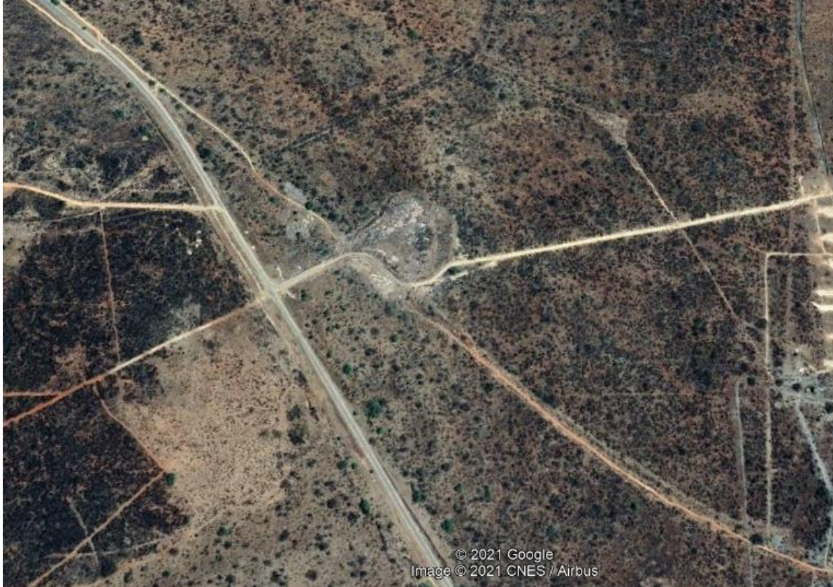
Figure 1: Current dumpsite

According to the Local Authority Act of 1992, waste management it is the function of the municipality to remove and dispose all waste types within the jurisdiction. The Environmental non-compliances that were identified at this site were as follow, burning of waste, windblown litter, no access control due to no fence structure, illegal waste pickers and animals.