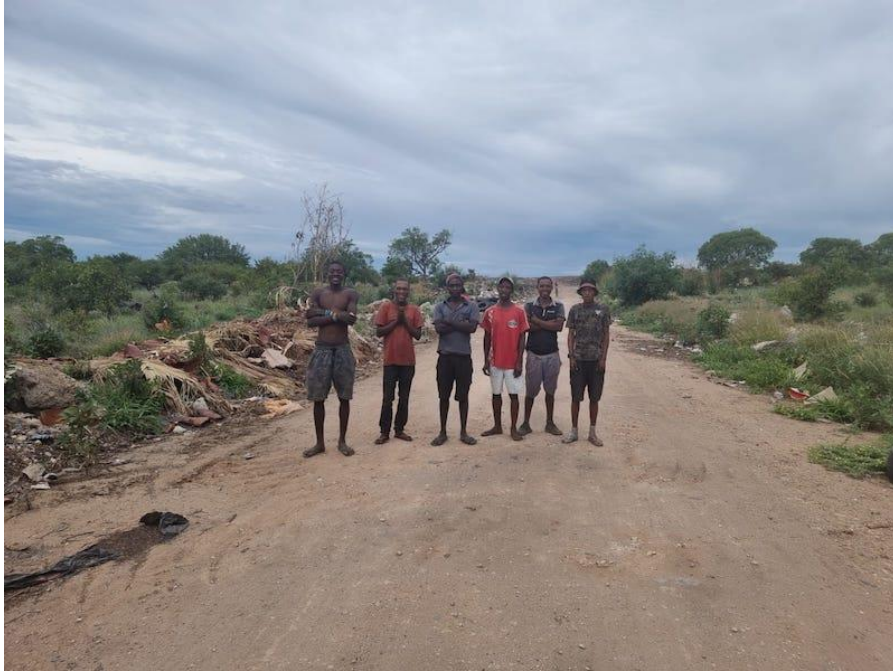
Figure 2: Waste pickers