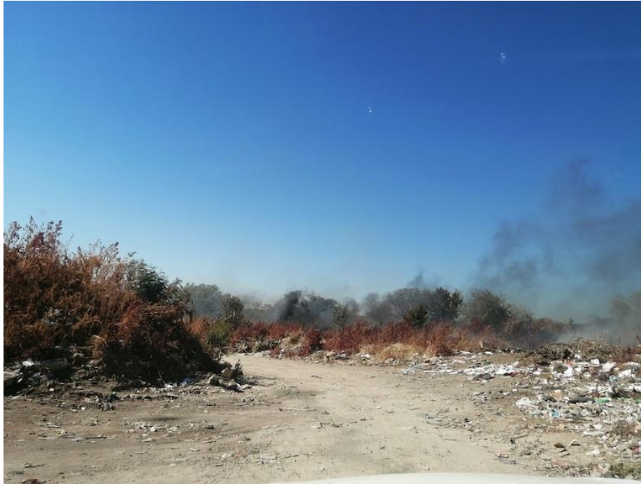
Figure 5: Open Fire Burning

Surface run off drainage system shall be installed at the foot of the heap above the leachate pipes. An open canal will be excavated to catch the rainwater surface run off coming from the heap. Water shall be collected at the collection pump pit for discharge to the outflow area.