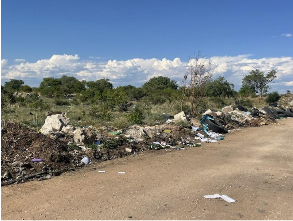
Figure 12: Illegal Dumping at Dumpsite Entrance