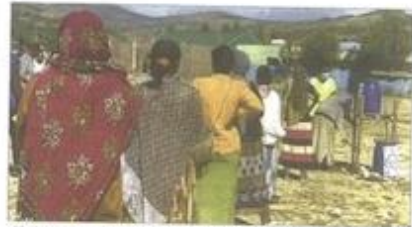
Ihukwana yomahopeko popalula oyindji moEthiopia inayi mona ekwatho.

Ipongelo oya kala okokupewa usama, kwa talika kutya itali longo shigwanana okokaleka po egameno yaanona noku kelala iponga kookokola. Okulongela moongulu dhaosikola dhihwalu okwa keelwa moshilongo, ihe epangelo lyali tala posha pelala lyashikola. Niger oku na ompumbwe yikweethilongo ya kolonda, mwa kwatelwa ompumbwe yuongulu dhaosikola moshilongo shoka ehi na santu oyendji kaseye shi oku leha, nosilili wo shiwewe shamushilongo mbyoka yi na santu oyendji yeli moshilongo.