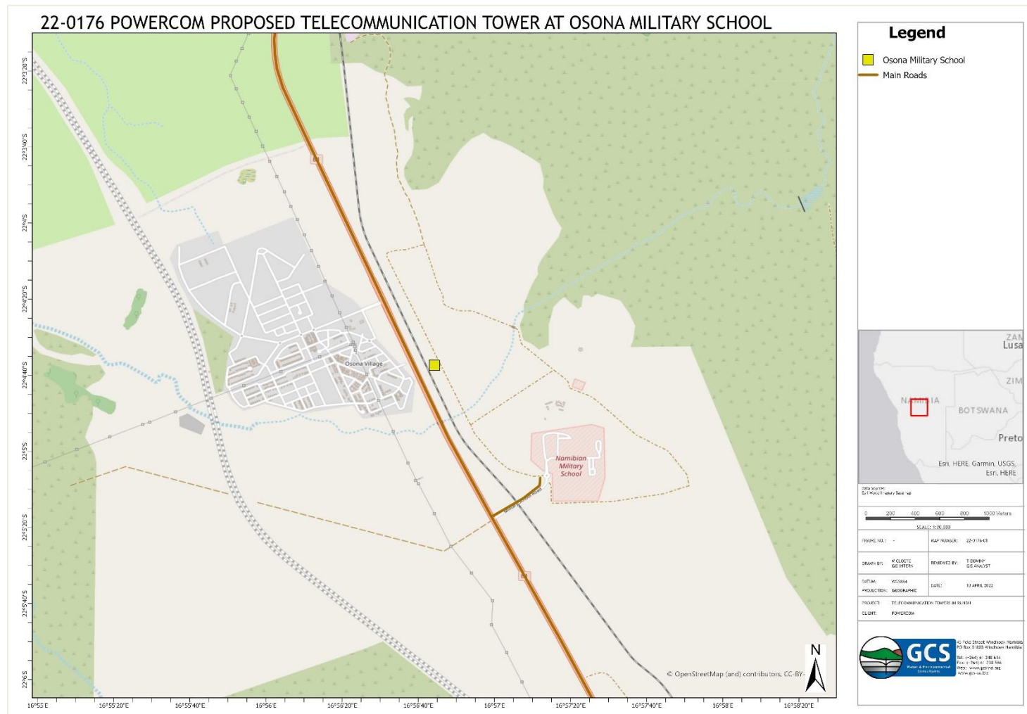
Figure 1-1: Locality of proposed telecommunication tower at the Military School