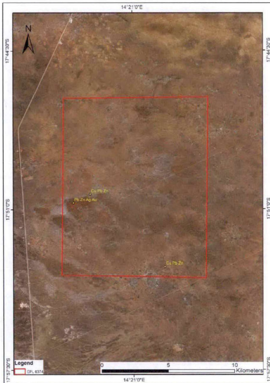
Figure 2 A map showing the mineral occurrences within the exploration licence.

Although mineral exploration is very costly and risky, environmentally friendly exploration is a cornerstone, yet the mineral exploration process must never be at the expense of people or the environment. Nami Geological Techniques (Pty) Ltd believes that social and environmental responsibility is a prerequisite for providing a conducive environment for mineral exploration and future mining activities. Impala Consulting cc was appointed by the proponent to undertake an Environmental Assessment (EA) and Environmental Management Plan (EMP) for the mineral exploration project. Figure 2 below shows the mineral occurrences within the area.