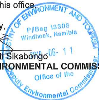
Fredrick Mupoti Sikabongo DEPUTY ENVIRONMENTAL COMMISSIONER