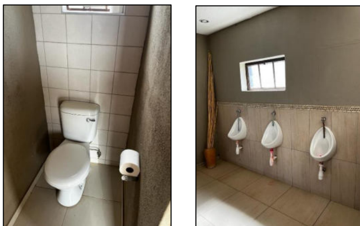
Figure 1-3: Ablution facilities.