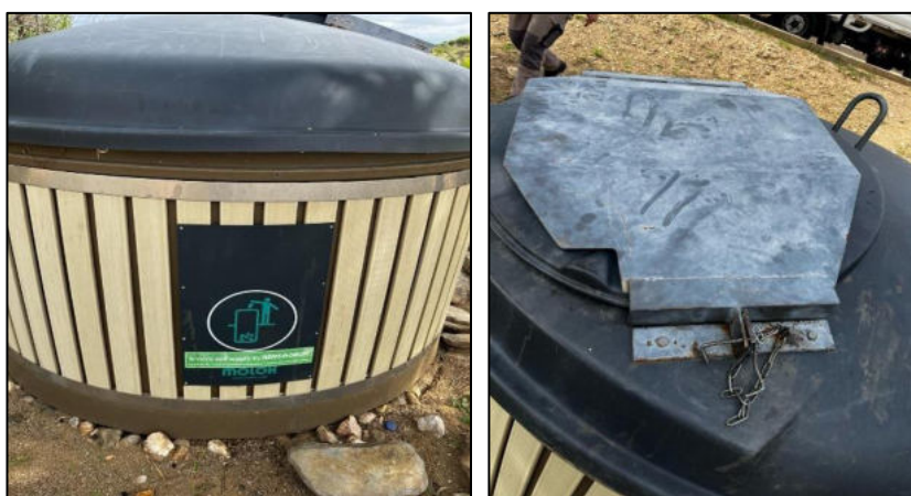
Figure 1-2: General waste collection on site.

The general waste at Daan Viljoen lodge and campsite is collected in designated moloks onsite. Rent-a-drum collects it every two weeks for recycling.