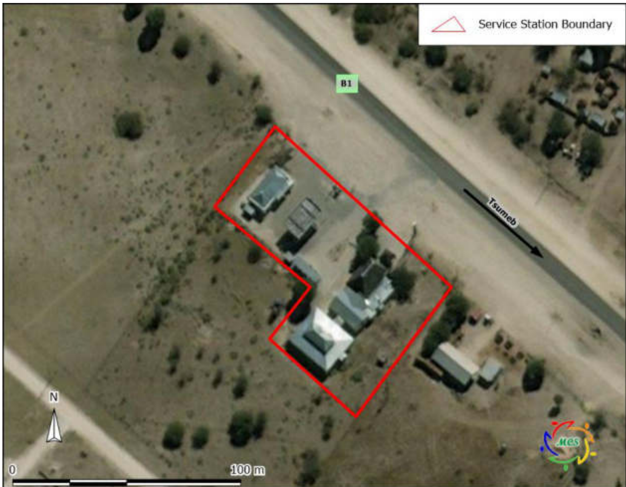
Figure 2. Layout of the site

The town of Omuthiya is situated approximately 80km southeast of Ondangwa. The site is generally flat with a gentle slope towards the east. Land use in the area is classified as commercial. The fuel retail facility occupies an approximate land size of 5,000m 2 .