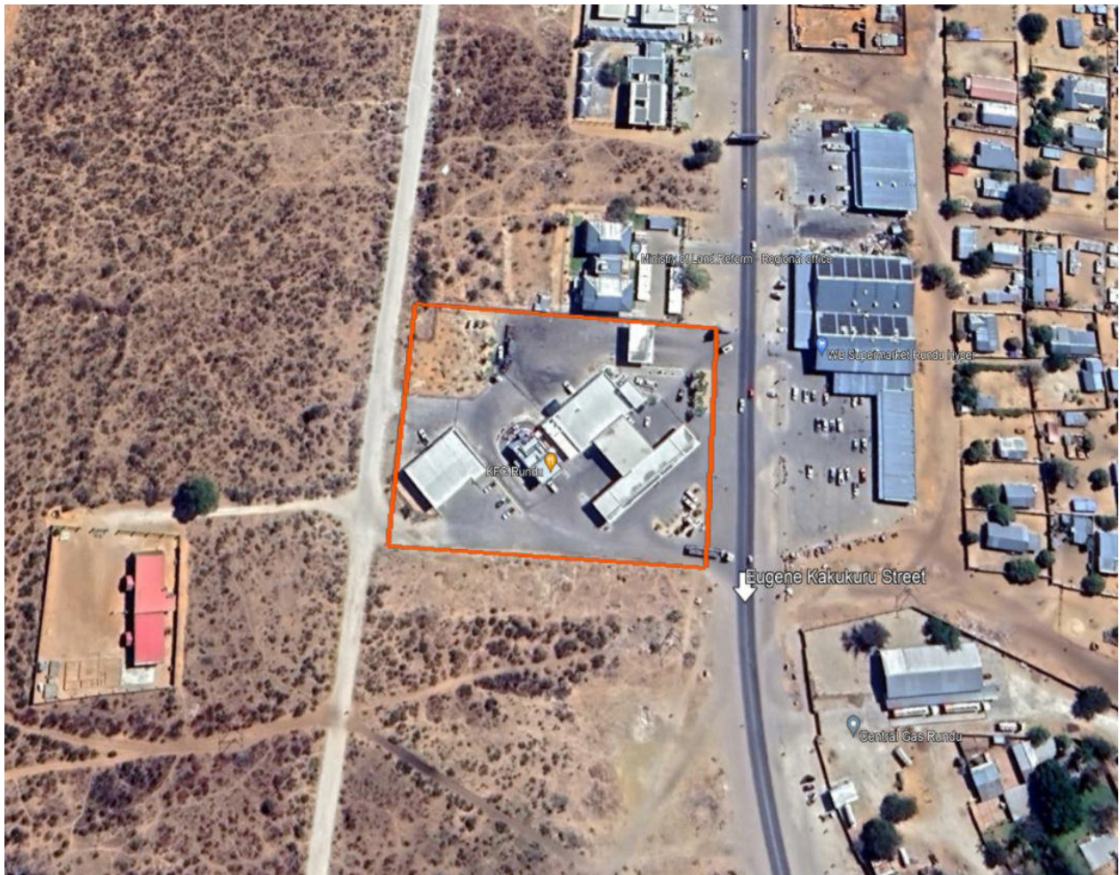
Figure 2. Layout of the site

Directly north of the site is the Ministry of Land Reform. East of the site is Kakukuru Street, followed by Woermann Brock Hyper. Directly south of the site is also undeveloped land (open land), followed by an open market and taxi rank. West of the site is undeveloped land.