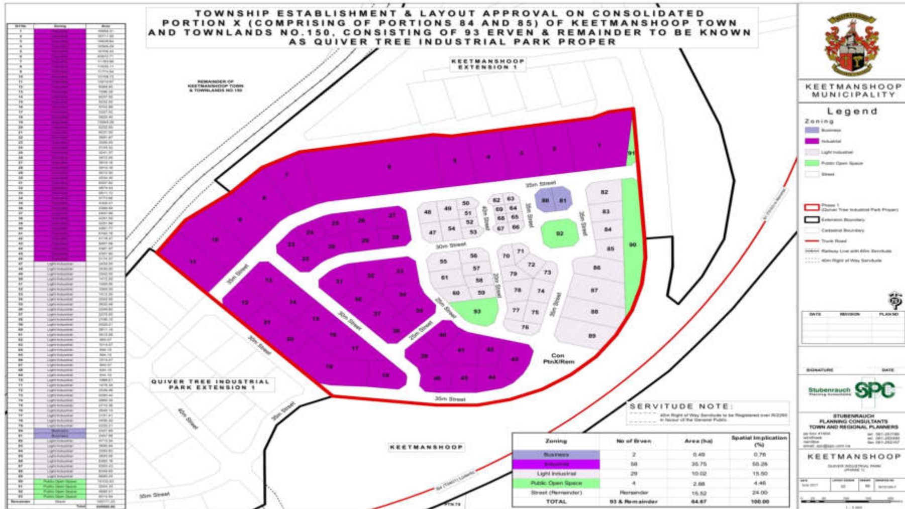
Figure 2: Proposed Layout Plan