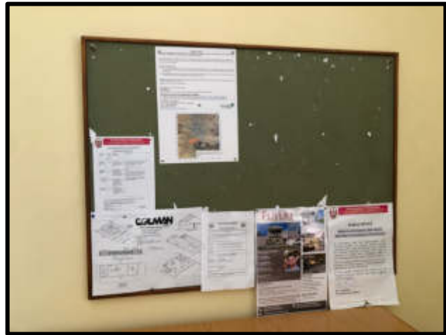
Figure 5: Site Notices on the project development were posted on site and at Keetmanshoop Municipality notice board