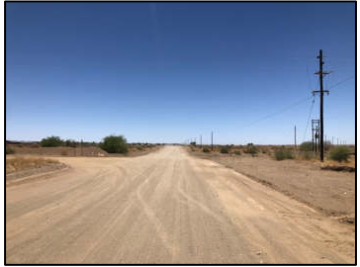
Figure 3: Left-Shrubs on site and existing railway line in horizon, Right-Existing access road to the site