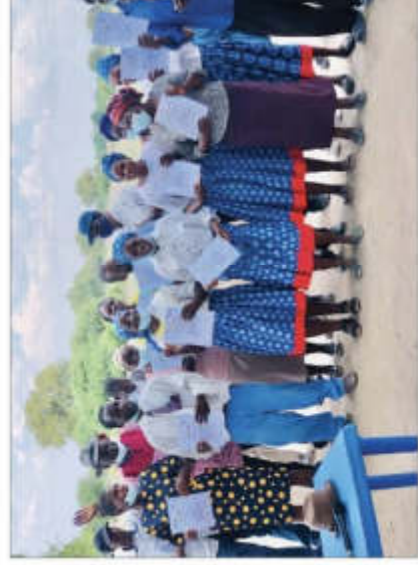
Certified... Rundjara village farmers showcasing the certificates they received from the Farmers Business School.