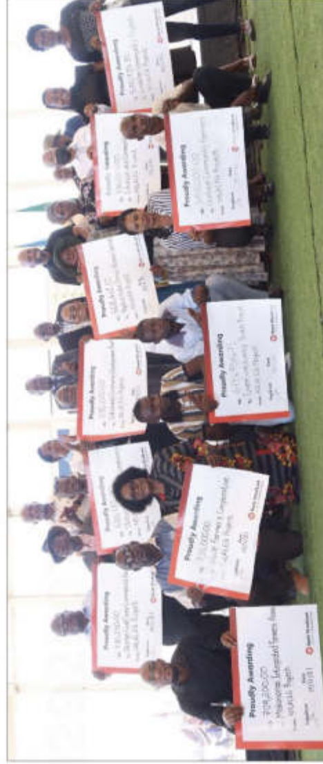
Beneficiaries... Ten projects benefited from the NILALEG project worth N$6.8 million.

"It is commendable to note that achieving this milestone amidst the challenges of the