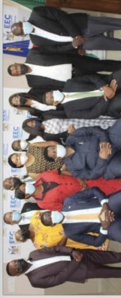
New brooms... The new commissioners pose for a group photo with labour minister Utami Nujoma and Otjozondjupa governor James Cerrikau.

OTJOWARONGO – Twenty-eight newly appointed members of the Employment Equity Commission (EEC) of Namibia yesterday officially received their appointment letters from labour minister Utami Nujoma.