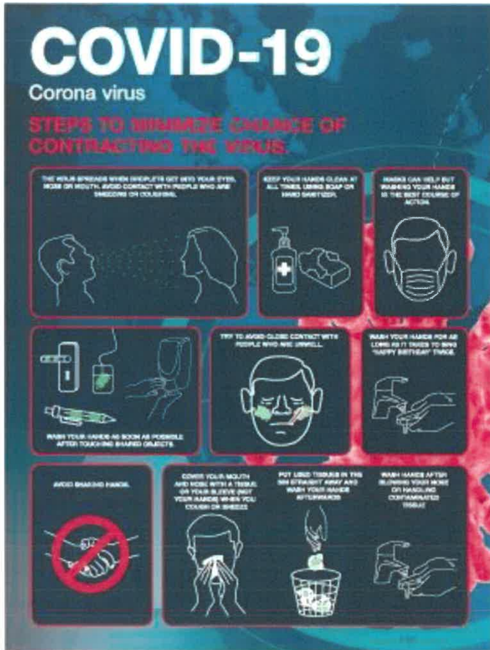
Figure 1: Typical COVID-19 information poster to be placed at designated areas at the mining sites.

Sanitisers (as per World Health Organisation guidelines) should be made available at the entrance and exit points of all screening facilities, security entrances and all entrances and exits at the common