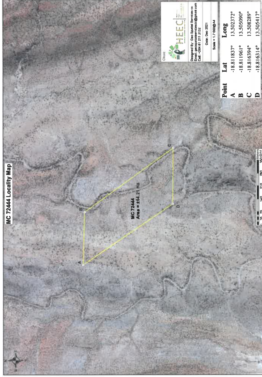
Figure 3 : Locality map for Mining Claim 72444 in Otjikondavirongo Village, Opuwo Rural Constituency, Kunene Region, Namibia (HEEC, 2022).