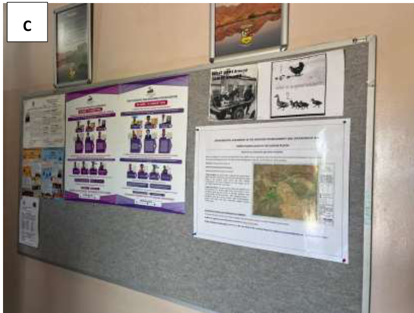
Photos of the EA poster pasted in Khorixas (A – Town Council, B - OK Grocery Store and C - Khorixas Constituency Office notice boards)