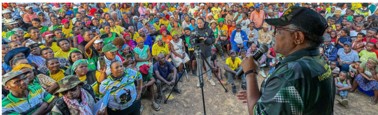
On the ground... ANC secretary general Fikile Mbalula during a Western Cape province campaign event in Paarl.