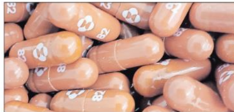
An experimental Covid-19 treatment pill, called molnupiravir.

An MPP spokesperson said deliveries from some firms covered by the deal could start as early as February. However, that will be subject to regulatory approval.