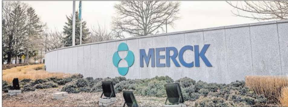
Merck & Co. headquarters in Kenilworth, New Jersey, US.

That is far below the US$700 per course the United States agreed to pay for an initial delivery of 1.7 million courses, but twice as high as first estimated by the World Health Organi-