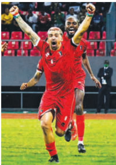
FAIRYTALE RUN ... Minnows Equatorial Guinea (left) and giants Egypt on Wednesday edged Mali and Ivory Coast in penalty shoot-outs to reach the Africa Cup of Nations quarter-finals.