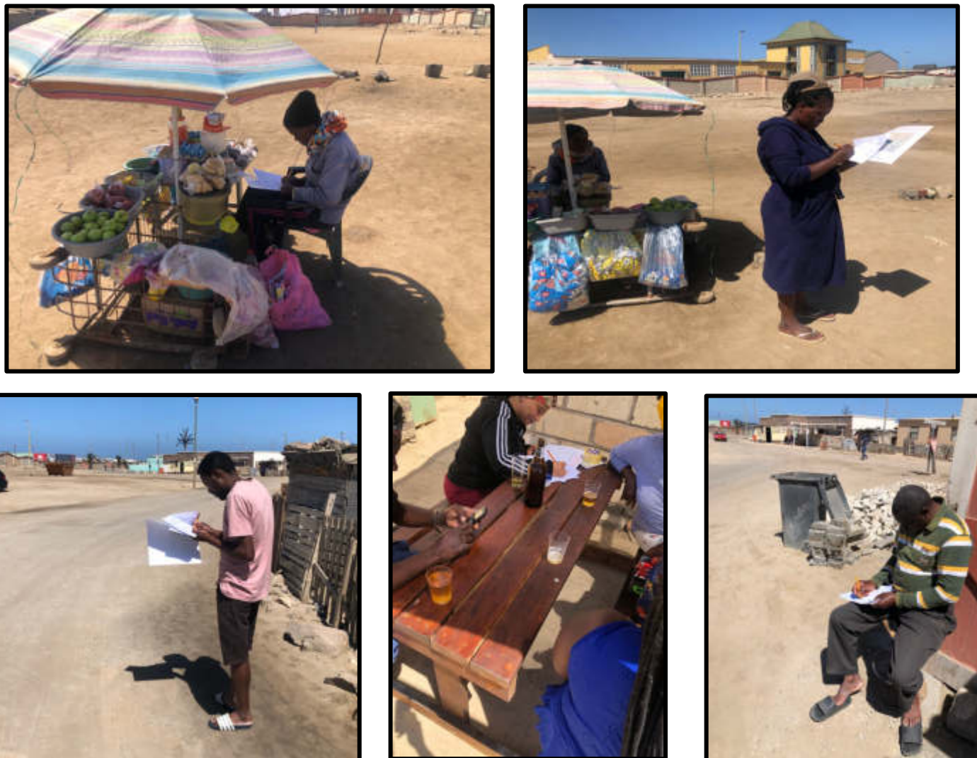
Figure 14: Door to door consultation was conducted to ensure that all neighbours are fully consulted.

A public meeting was scheduled on 04 December 2021 however the meeting was poorly attended. However, the consultant ensured that the Municipality and all neighbours of the project site were adequately consulted. The consultant administered questionnaires door to door and on email through email to all members who attended the meeting as well as other members who were recommended by the public that they should be consulted.