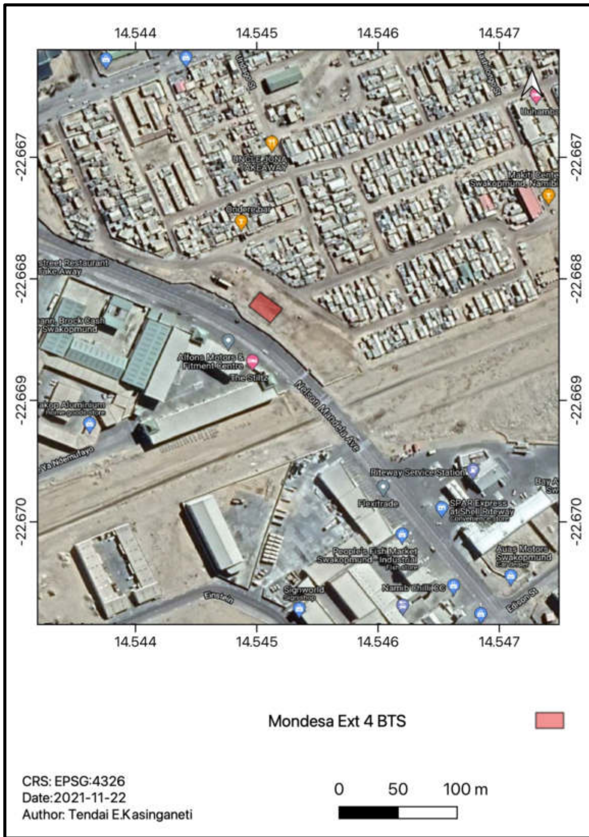
Figure 1: Proposed Project Site.