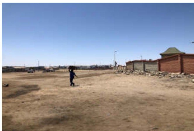
Figure 5: Left-Access road to the site and a greenspace maintained by the municipality.