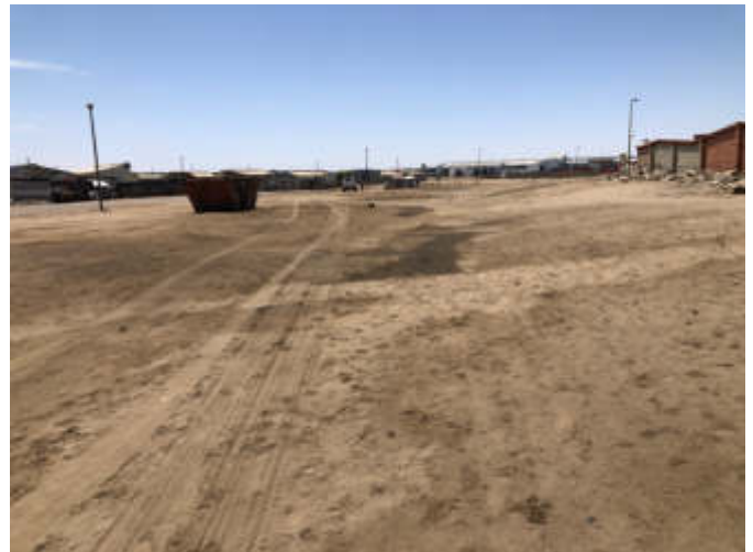
Figure 4: Current project area status (solid waste containers, informal market stall visible in sight)