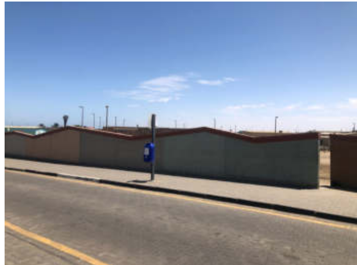
Figure 8: Top Left-Skip container placed on-site to prevent pollution on the open piece of land.