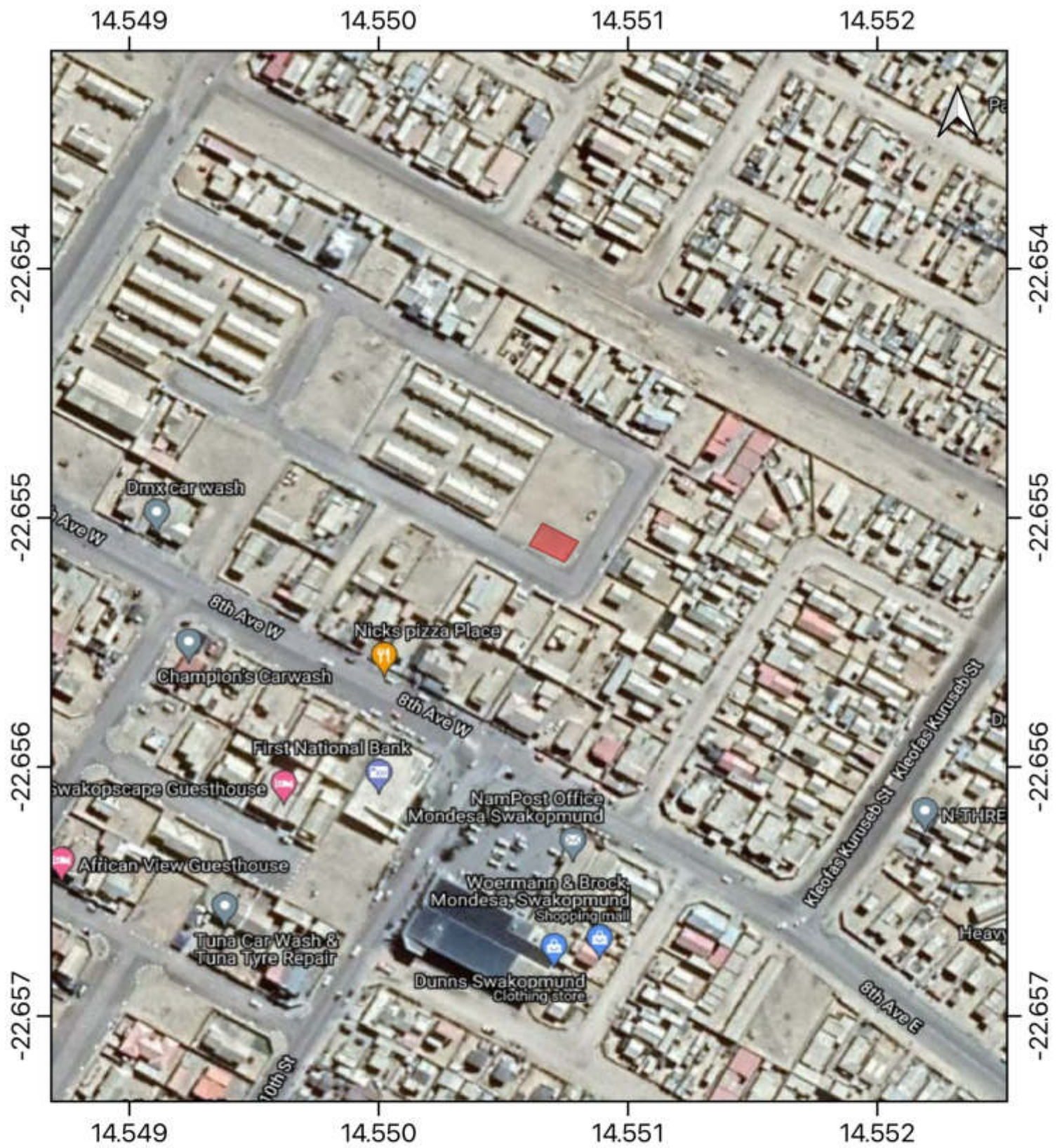
Mondaša Ext 3 BTS