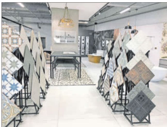
SpecTiles at Pupkewitz Megabuild in Walvis Bay.