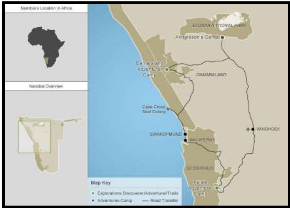
Figure 2: The location of Damaraland adventure camp