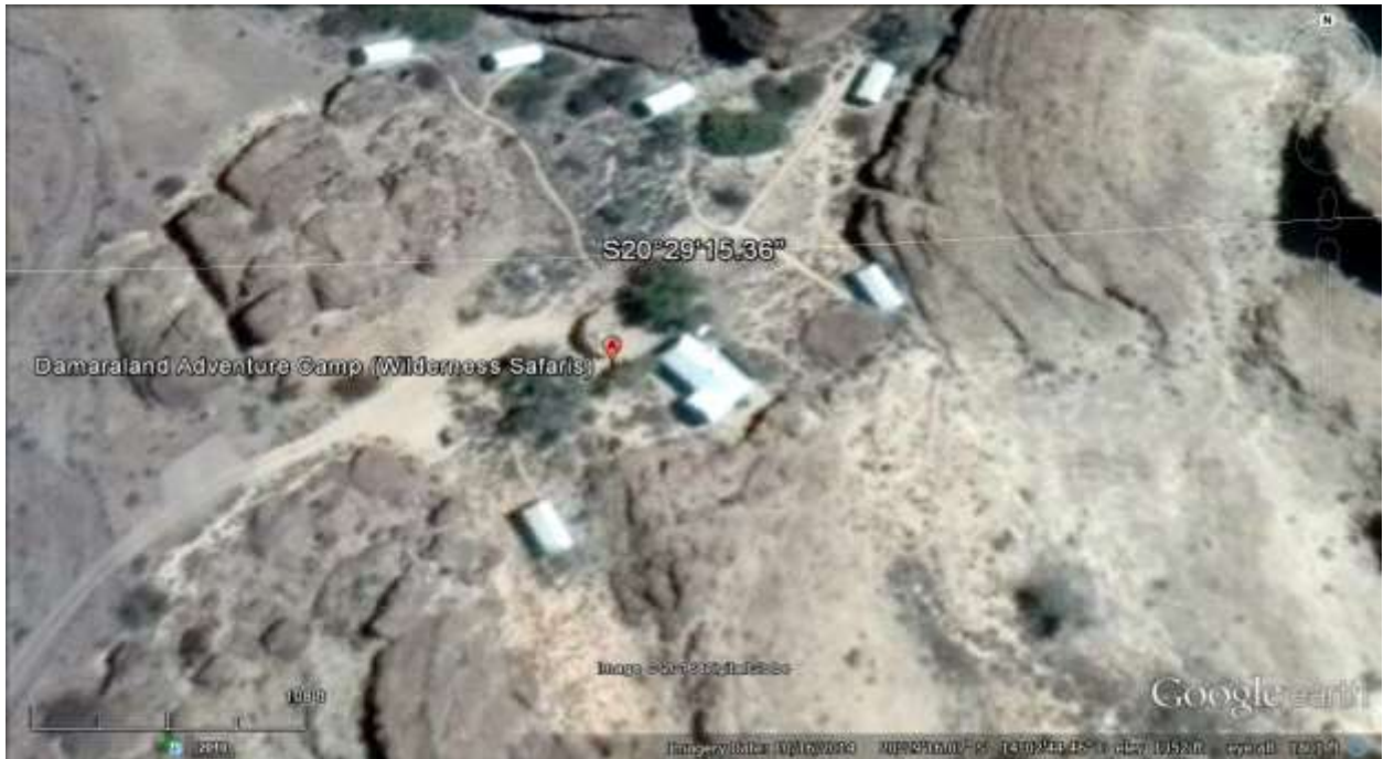
Figure 3: Google earth image of Damaraland adventure camp