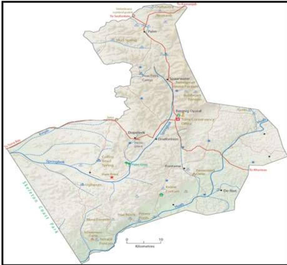
Figure 1: The Torra conservancy map