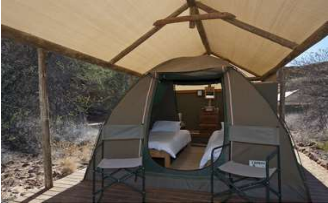
Figure 4: The tourist tented accommodation