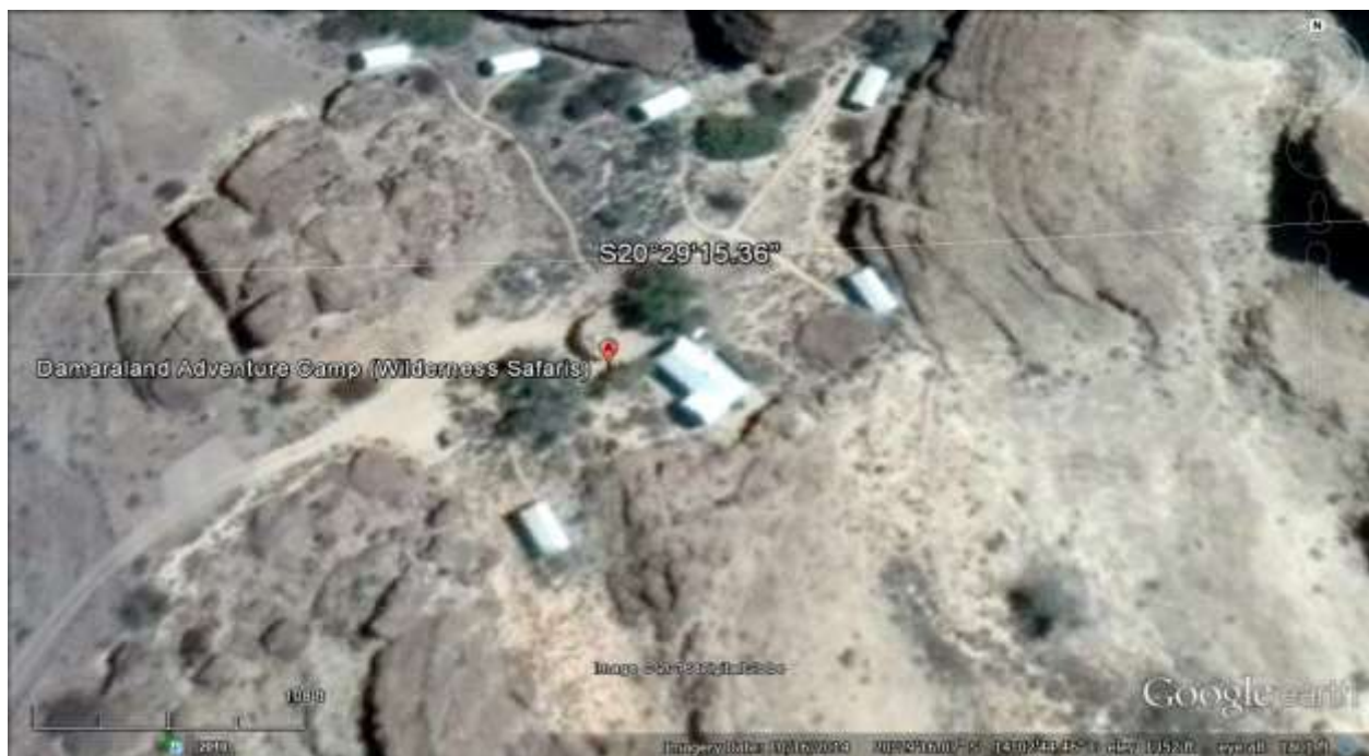
Figure 3: Google earth image of Damaraland adventure camp

The Camp is accessed by road, and only guided tours with experienced guides service this camp.