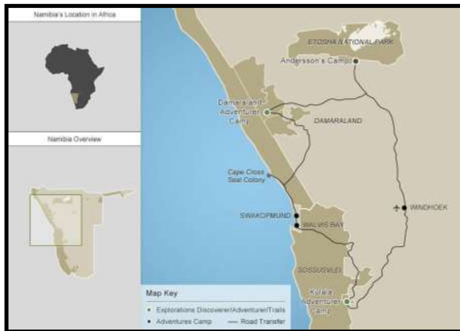
Figure 2: The location of Damaraland adventure camp