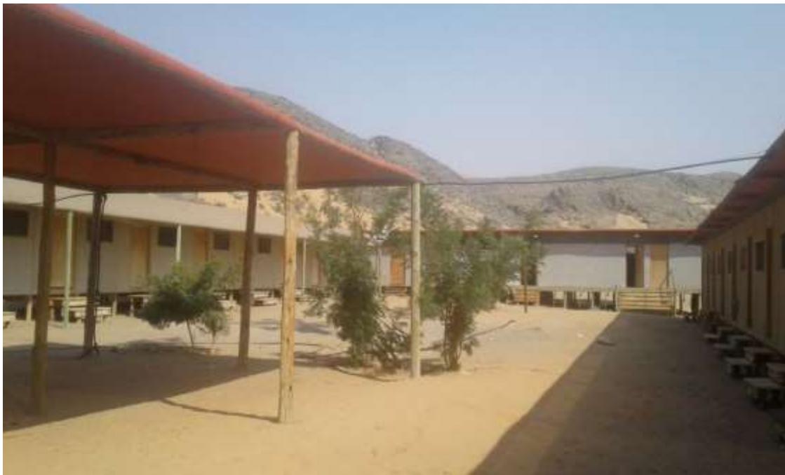
Figure 4: The junior staff accommodation