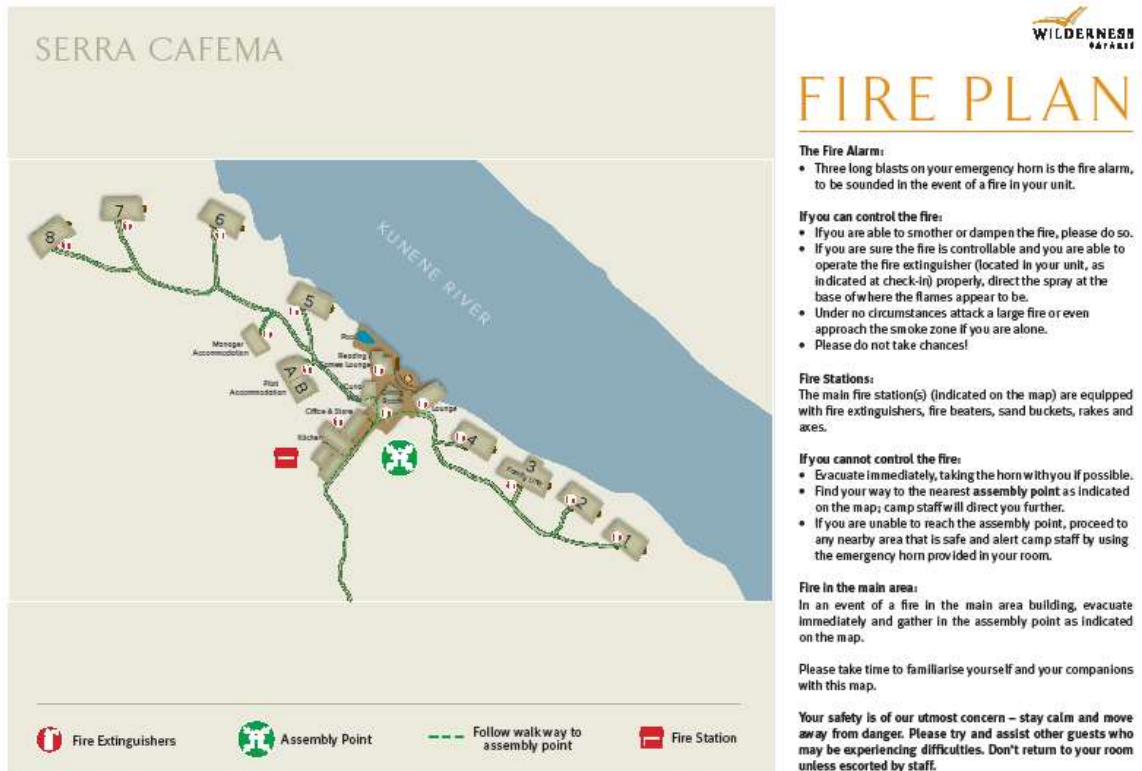
Figure 3: Serra Cafema Lodge lay out and fire plan