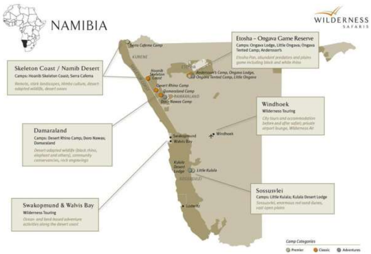
Figure 1: Map of Namibia with the location of Serra Cafema Lodge