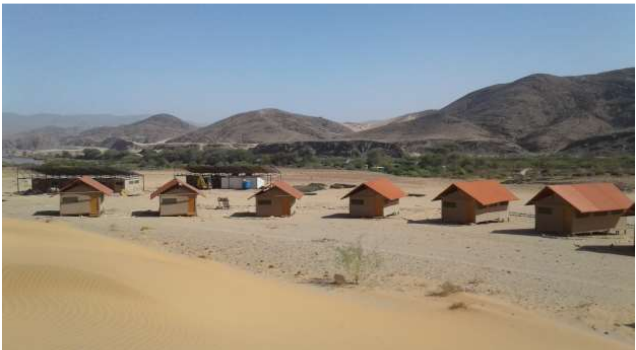
Figure 6: Management and guides accommodation