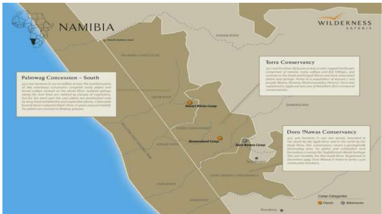
Figure 2: The location of Desert Rhino Camp in the Palmwag Concession