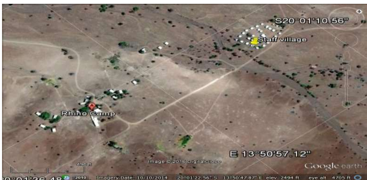
Figure 5: Google earth image of Desert Rhino Camp and staff village