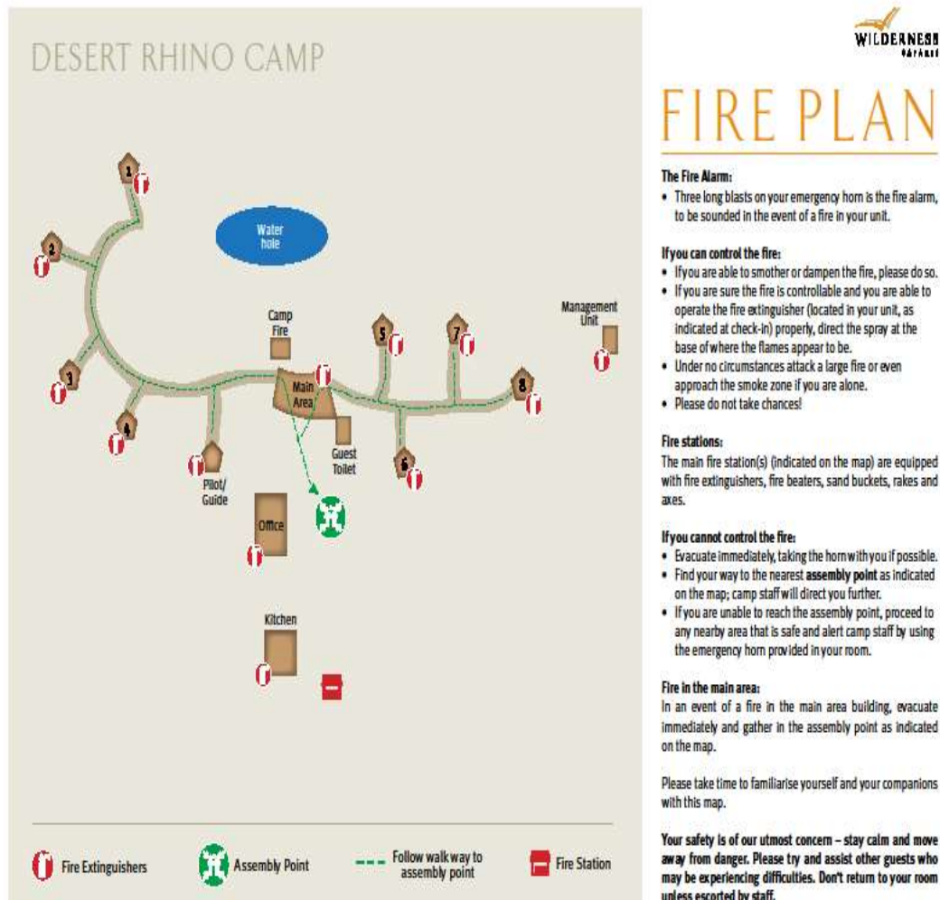
Figure 3: Lay out of the camp and fire plan